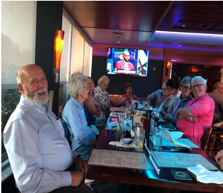
Supper Club Calhouns September 2021