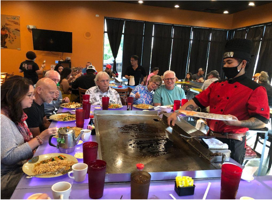
Supper Club Asian Café August 2021