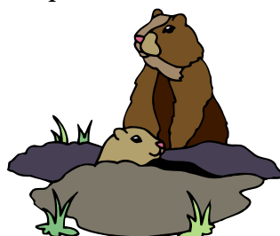
"The Gopher" - WHT Senior Citizens Van

We have only three requirements to use the service. First you must be age 60 or older, second you must be a resident living in the township and third you must be able to get in and out of the van with minimal assistance. We are not permitted to take wheelchairs.