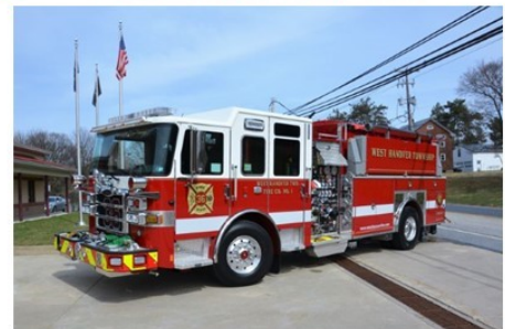
WH FIRE CO ACTIVITIES