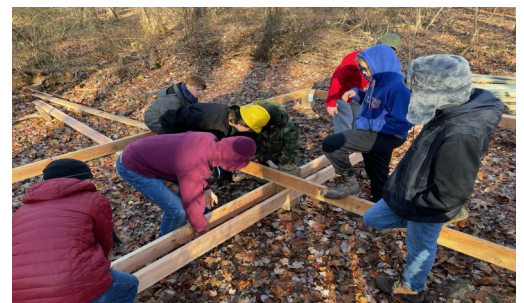
Boy Scout Troop 10 working on the camping area at Fairville Park