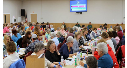
October Lions Bingo