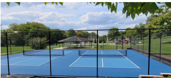
New Pickleball Courts

Please note, the portable restrooms have been removed for the winter and will be back on April 1. We wish you all a safe and happy holiday season and look forward to seeing you again real soon!