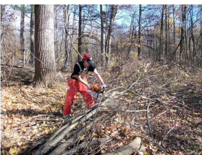
DC Vo-Tech students clearing brush at Mt. Laurel Park