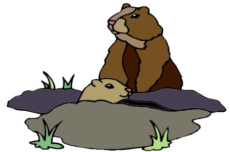
"The Gopher" - WHT Senior Citizens Van

We will take you shopping, hair appointments, and just about anywhere you wish to go...as long as it is within a 15-mile radius of the Township Building. Medical appointments are always a priority so be sure to schedule them as soon as you have them.