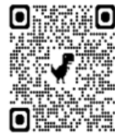
Planning Center Registration QR Code

Our goal is for everyone who attends St. Paul to be registered 😊