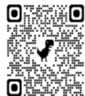
Planning Center Registration QR Code

Our goal is for everyone who attends St. Paul to be registered 😊