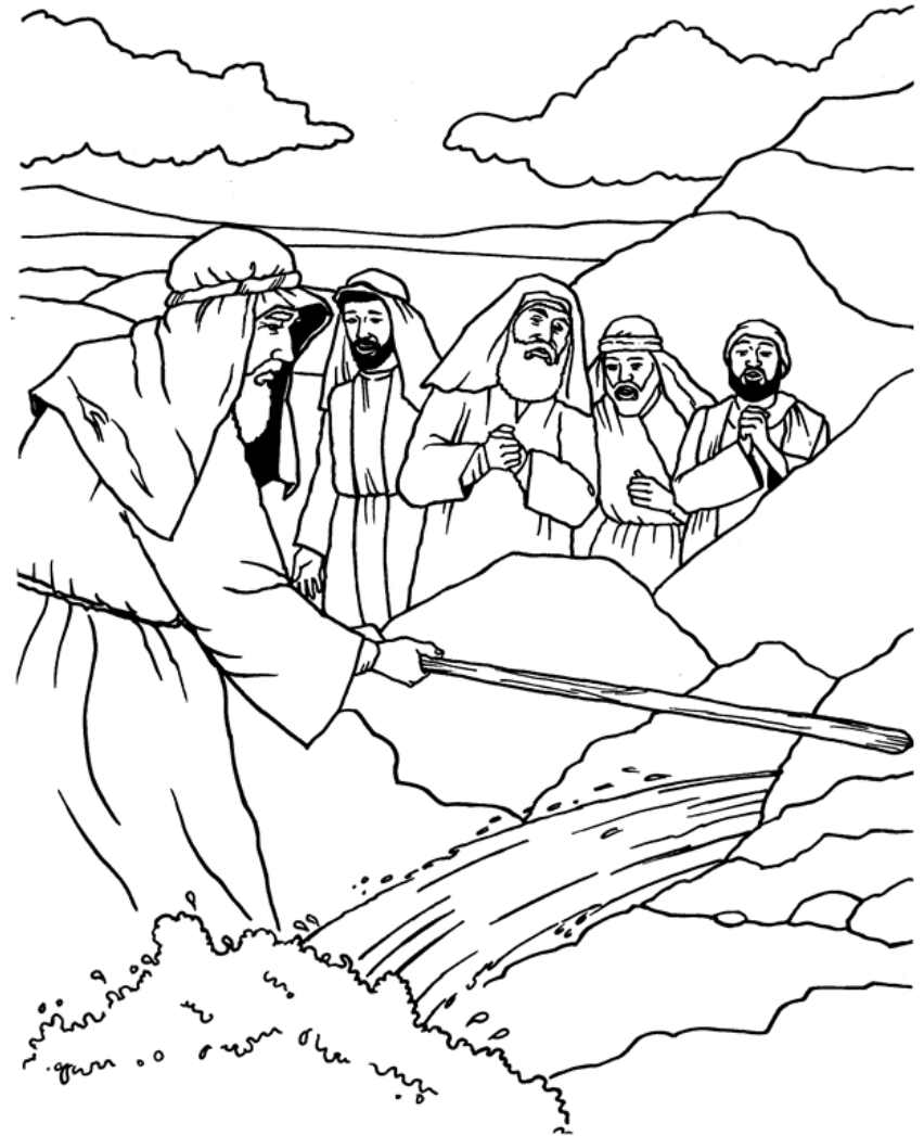
Moses Strikes the Rock Exodus 17:1-7

From BibleStoryCard Learning System(tm) Coloring Book © 1996 Wesleyan Publishing House Used by permission. Additional BibleStoryCard resources available by calling 1-800-493-7539 or visiting online http://www.parable.com/wph/group_1052.htm