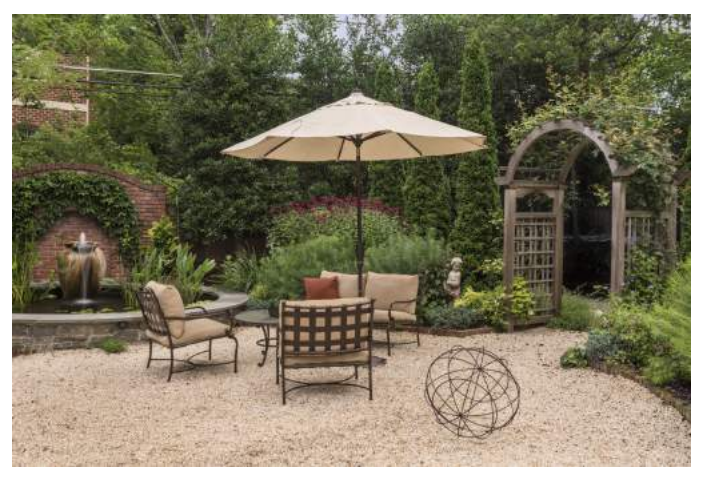
Everett Garden, Chevy Chase

Please note: You may begin your tour at any garden. Admission is $7 per person (the Georgetown gardens are considered as one admission) and the gardens will be open rain or shine.