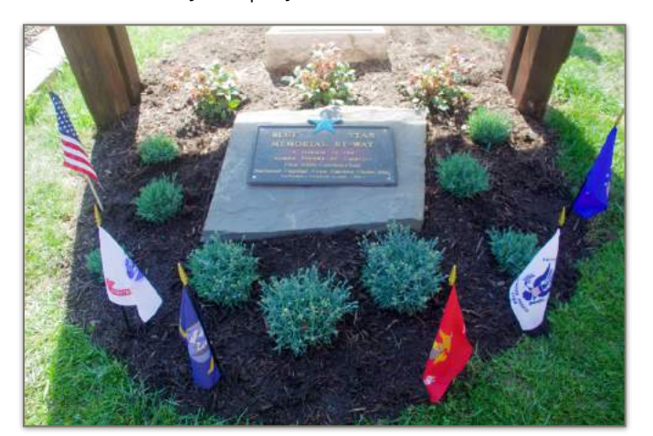
A Fresh Look