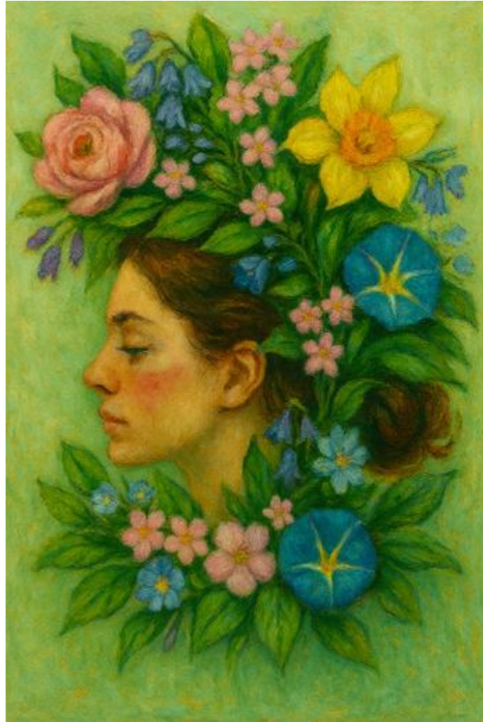
Schedule artwork created by Microsoft Co-Pilot