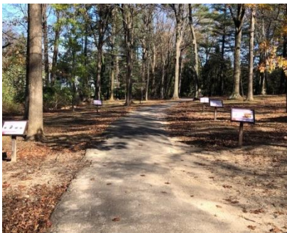
Photo from the Town of Vienna website of Glyndon Park