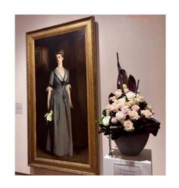
For more images of the exhibit, click on the link below for Lura Marshall's video: http://emieng.com/VMFA_2024_Flowers_AND_Fine_Art.m4v