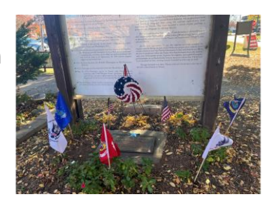
Veteran's Day Recognition at the Blue Star Memorial