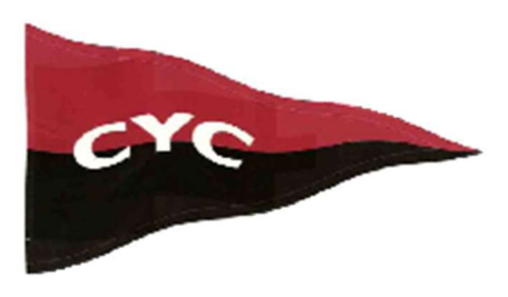
Cathlamet Yacht Club TELEGRAPH FEBRUARY 2019