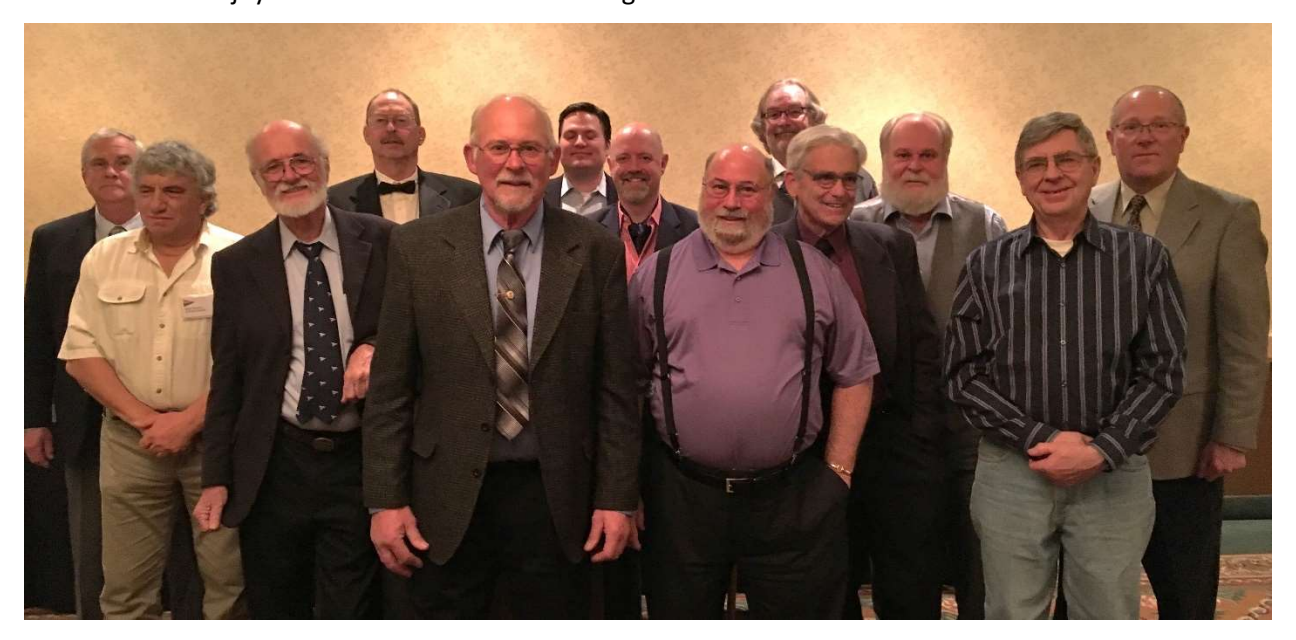
The Ladies and Gentlemen who attended this year's Commodore's Ball

On Sunday morning most of the members who stayed overnight came down to the hotel's complientary Breakfast and enjoyed another round of socializing.