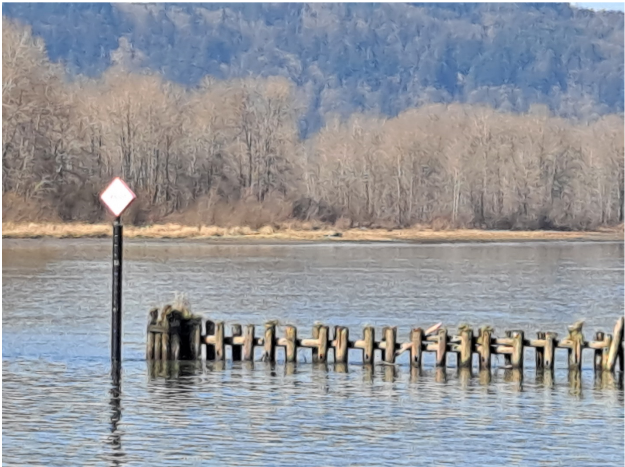
The new DANGER sign on the pile dike at the Puget Island Ferry dock

Over this winter a maintenance crew did maintenance work on some of the pile dikes in the river channels. As part of this work they installed warning signs at the end of any of the pile dike that they worked on that didn't have a red or green day marker associated with it. Some of these pile dikes, like the one at County Line Park, are very dangerous as they are completely submerged at high water. The signs are white diamonds with red borders and the word DANGER printed on them, mounted on black pilings.