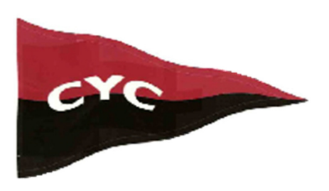
Cathlamet Yacht Club NEWSLETTER MAY 2018