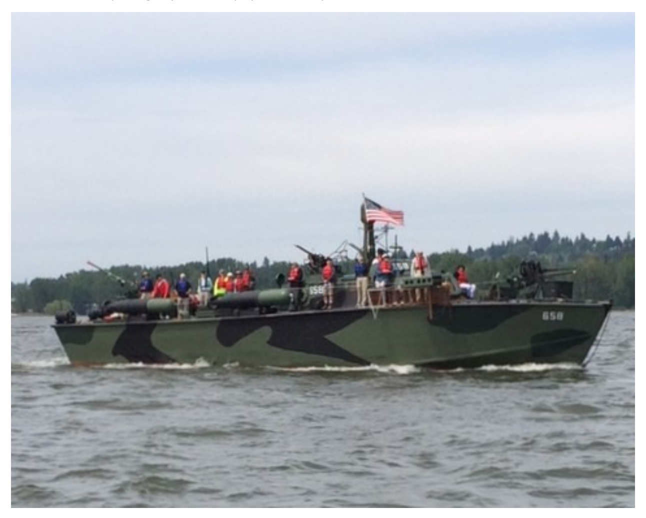
The restored WW II PT boat complete with torpedoes

wonderful hosts. There were 10 different clubs participating in the parade. It was quite the gala. Apart from all the multi-million dollar yachts down to the Cascade 36s, one of the really special entries was the PT Boat, festooned with all of the anti-aircraft weapons, 50 caliber machine guns, torpedoes and of course depth charges. It was quite the honor to be welcomed aboard one of the review boats and to see this annual opening day ceremony up close and personal.