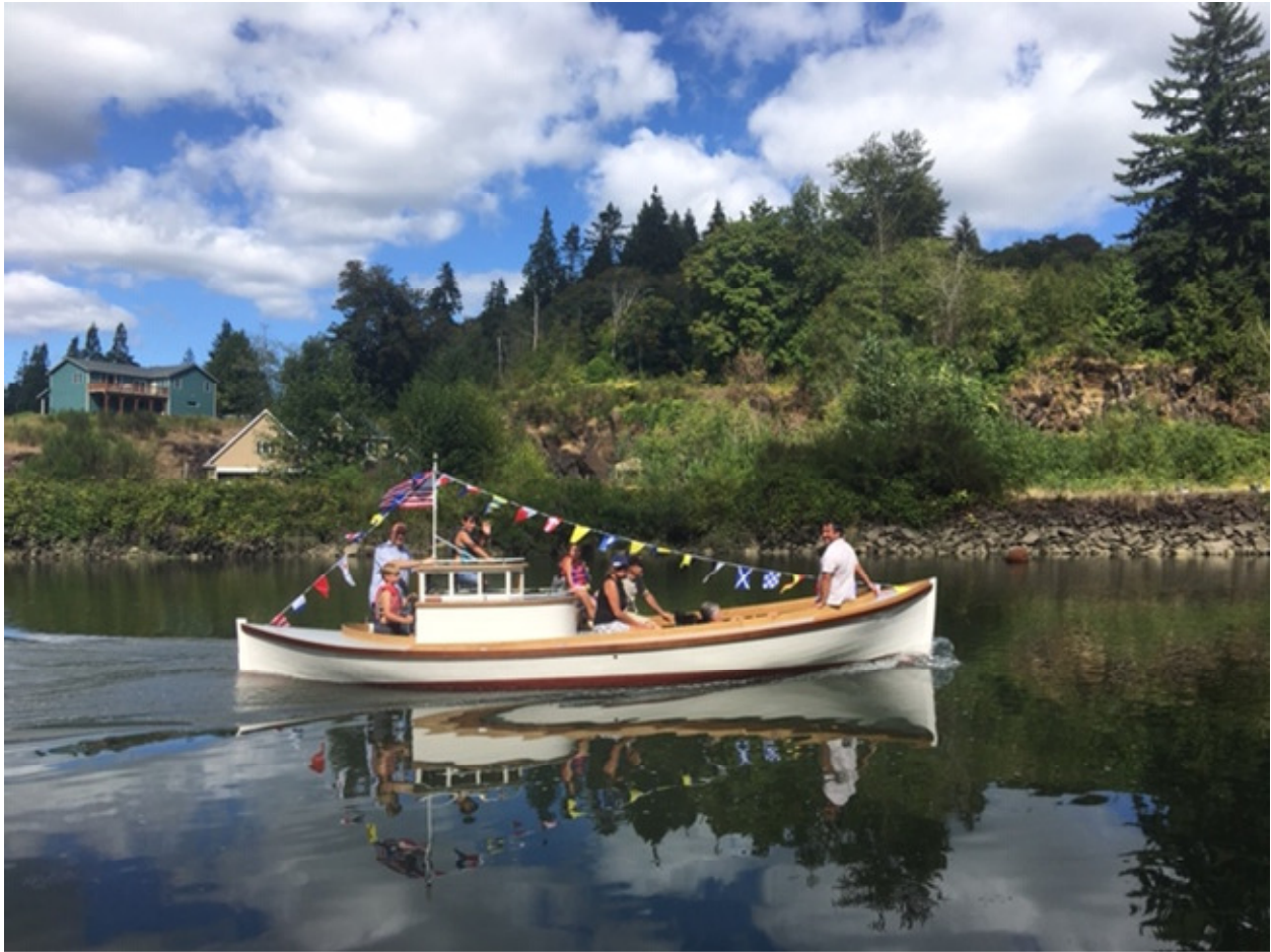
The John M back in action

All of the restoration was done by replacing each piece removed from the boat with an exact duplicate new piece. He repowered it with an electric motor and a large battery bank and plans to take it back to Portland under its own power.