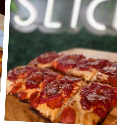
the big detroit