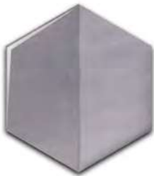
Magnet SIL 39