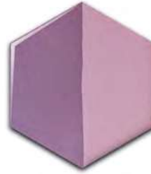
Lavender SIL 60