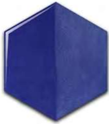
Sapphire SIL 45