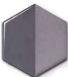
Ash SIL 55