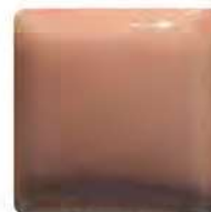
Pink Blush EM-1105 (O)