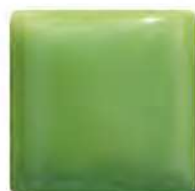
Apple Green EM-1027 (O)