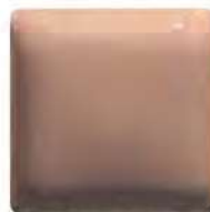
Peach Blush EM-1103 (O)