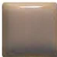
Nude EM-1019 (O)

Our extensive line of non-toxic colors make Laguna glazes just right for recreation, classroom projects, and artists for all applications.