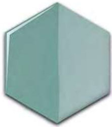
Seaglass SIL 47