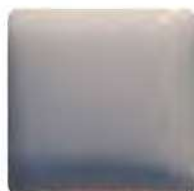
Cool White EM-1146 (O)