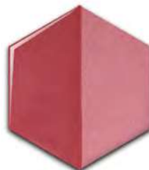
Rosy SIL 58