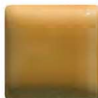
Marigold EM-1113 (O)