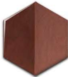
Milk Chocolate SIL 78