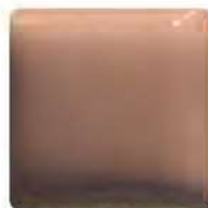
Creamy Peach EM-1104 (O)