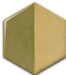
Avocado SIL 70