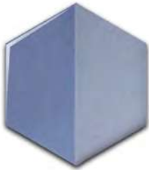
Slate SIL 71