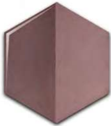
Suede SIL 61