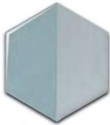
Aqua SIL 50