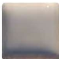
Alabaster White EM-1002 (O)