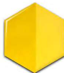
Sunshine SIL 1