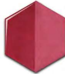
Dusty Rose SIL 34