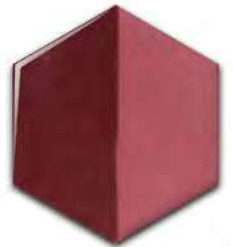
Wine SIL 46