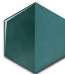
Dark Teal SIL7