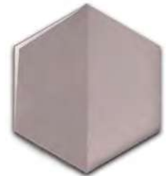
Light Grey SIL 74