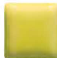
Spring Green EM-1009 (O)