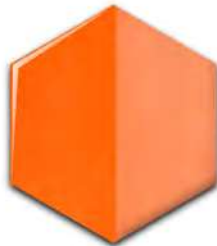
Carrot SIL 83