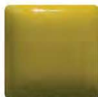
Sunburst EM-1021 (O)