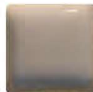
Eggshell EM-1100 (O)