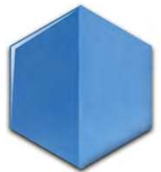
Blue Jay SIL 11