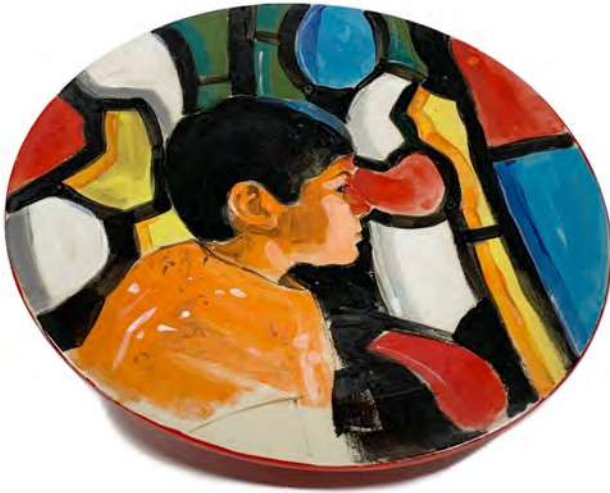
Artist: Pegah Samai

Our Cone 06 opaque "Silky" underglazes are designed for use on bisque and greenware. These colors do not run or blur, and hold their line when used for decorative purposes such as tile painting, sculpture or architectural applications. Silky Underglazes are available in 4 oz's, pints, and gallons.