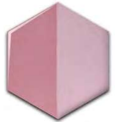
Flamingo SIL 22