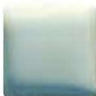
Edgewater EM-1136 (O)