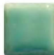
Frog's Pond Green EM-1011 (SO)