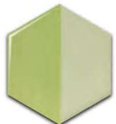
Lime SIL 28