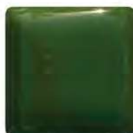
Elfin Green EM-1010 (O)