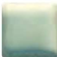
Morning Green EM-1154 (O)