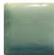
Sage EM-1134 (O)