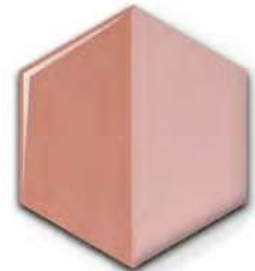
Plush Pink SIL 41