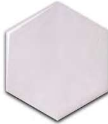
White SIL 54