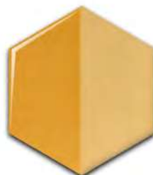
Sunset SIL 2