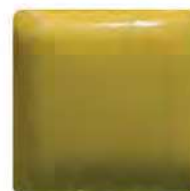
Kitchen Yellow EM-1033 (O)