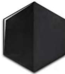
Raven Black SIL 10