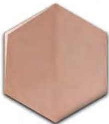
Almond Flour SIL 18