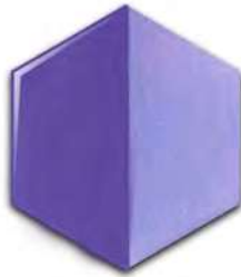
Royal Plum SIL 84