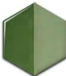
Clover SIL 8