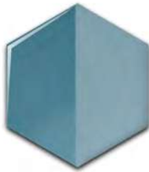
Denim SIL 67