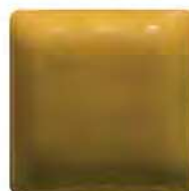
Golden Aspen EM-1004 (SO)