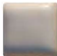
Matte Clear EM-1053 (SO)