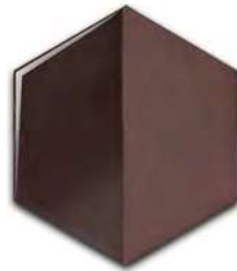
Dark Chocolate SIL 4