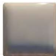
Super Clear EM-1050