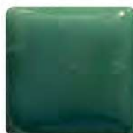
Jade Green EM-1115 (O)