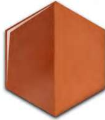
Cinnamon SIL 3