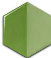
Cactus SIL 12