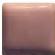
Cloud Pink EM-1106 (O)