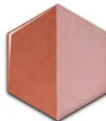
Blush SIL 16