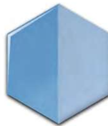
Baby Blues SIL 24