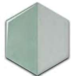
Minty SIL 49