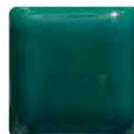
Azure Green EM-1022 (O)

Symbol Key: (M) Matte (T) Transparent (O) Opaque (SO) Semi-Opaque