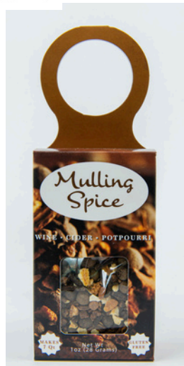
MULLING SPICE (1 oz) Cinnamon Chips, Orange Peel, Allspice, Cloves