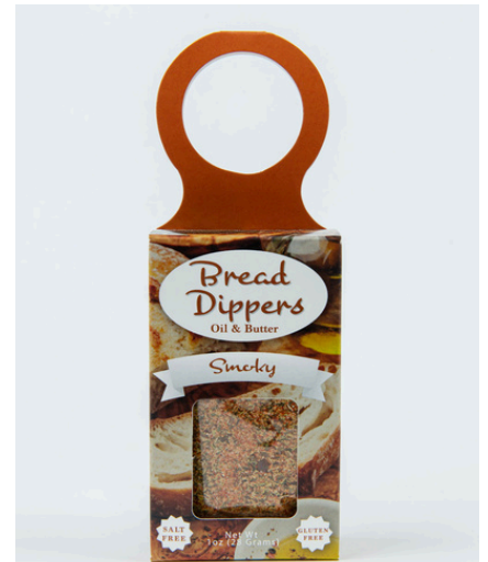
SMOKY BREAD DIPPER (1 oz) Roasted Garlic, Smoked Paprika, Basil, Rosemary, Tomato, Black Pepper, Onion, Red Pepper