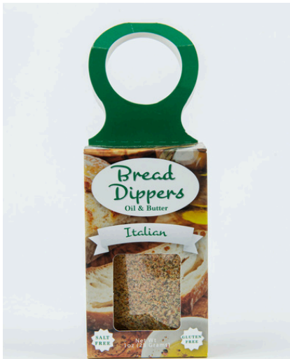
ITALIAN BREAD DIPPER (1 oz) Roasted Garlic, Oregano, Basil, Tomato, Black Pepper, Onion, Rosemary, Paprika

SUGGESTED RETAIL PRICE: $6.50 + Per Unit