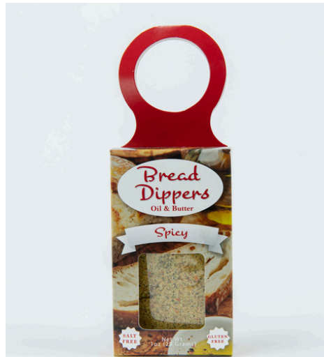
SPICY BREAD DIPPER (1 oz) Roasted Garlic, Jalapeno, Basil, Tomato, Onion, Black Pepper, Red Pepper, Rosemary