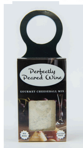
PERFECTLY PEARED WINE (1.5 oz) Sugar, Onion, Garlic, Salt, Basil, Natural Pear Flavors, and less than 2% Calcium Silicate to Prevent Caking