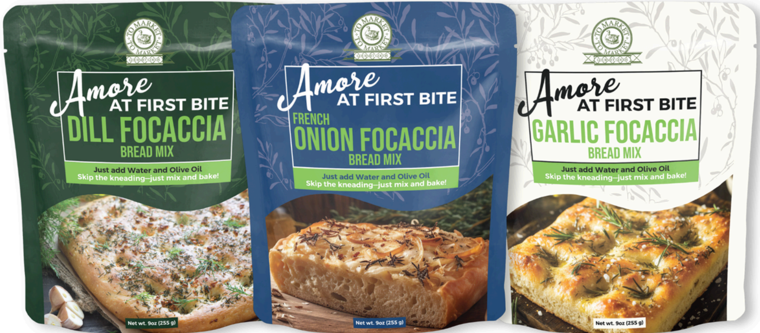
DILL FOCACCIA BREAD MIX (9 oz.)

SUGGESTED RETAIL PRICE: $8.95 + Per Unit