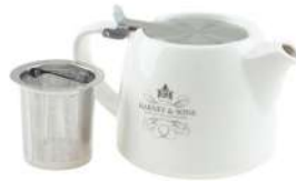
Harney & Sons Stump Teapot 46-7394-3 16oz white w/ Logo