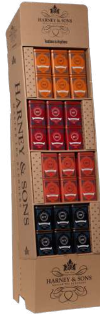
69-3821-2 48x20ct Holiday Shipper 69-3821-01 48x20ct Fall Shipper 69-3821-4 48x20ct Green Tea Shipper 69-3821-5 48x20ct Classic Collection Shipper 69-3821-6 48x20ct Premium Teabag Shipper