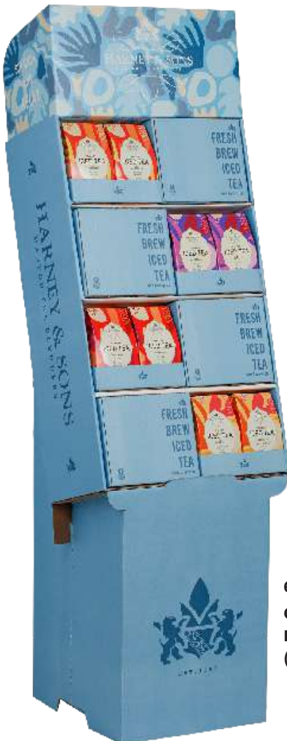
69-3821-05 Corrugated Floor Shipper (Holds 8 Cases)

F resh, fruity and delicious and only as sweet as you want it. In 3 ct. cartons with 3 pouches that each brew up two quarts of delectable tea. Or the 15 count bag that each brews two quarts. Wildly popular, and we've got a special new cardboard Floor Display Unit as shown right.