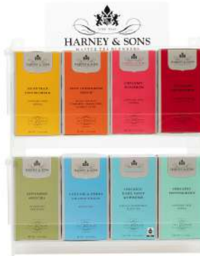
66-7071-3 Premium Teabag Lucite Rack (6)