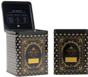
Hinged Storage Canister 50 sachets/1lb 46-7904-HB Black 46-7904-HC Cream