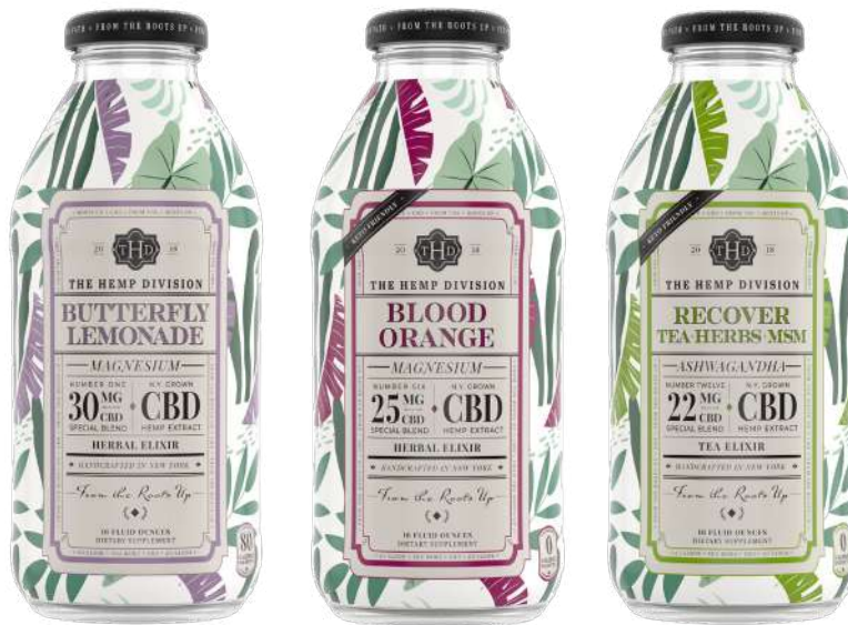
55-9507 Butterfly Lemonade (Rest)30mg