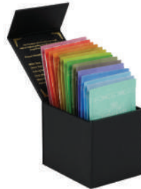
64-7031-4 1 Slot premium Chest- Empty 45-7001-G07 Teabag Sampler Black Box- Filled