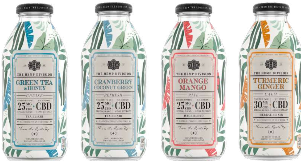
55-9511 Green Tea & Honey (Cruise) 25mg