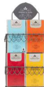
66-7071-1 4 Slot Premium