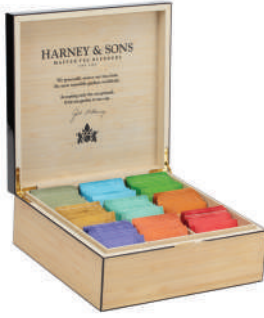
64-7031-3 Heirloom Chest: Black-Empty