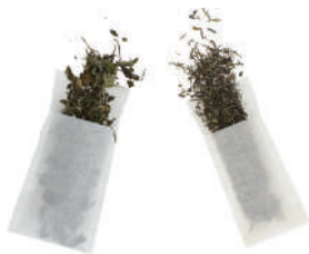
Finum Paper Filters 46-7441-L Large (2,400 qty) 46-7441-XL X-Large (1,800 qty)