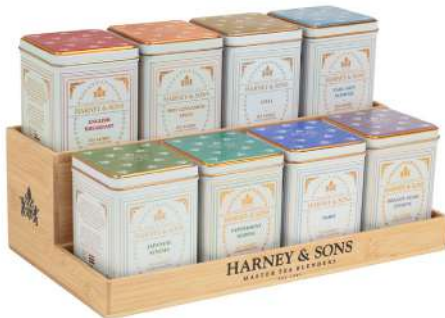
66-7073-2 Bamboo Stepped Tin Rack