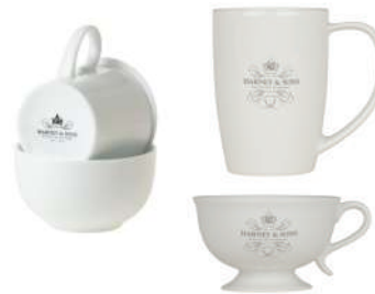
Harney & Sons Teaware 46-7521-4 Tasting cup set 46-7309-Mug 46-7309-Cup