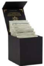
64-7032-3 1 slot Wrapped-Empty 45-7001-G09 Wrapped Sachet Sampler Black Box-Filled