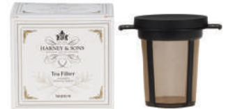
46-7443-M Medium Case of 12 Filters 46-7443-L Large Case of 6 Filters 46-7443-M1 Metal Permanent Filter w/logo