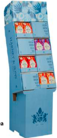
69-3821-05 64x3ct Fresh Brew Iced Tea