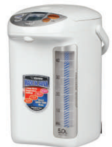
Zojirushi 46-7483-1 5 Litre Hot Water Pot