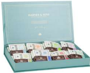
64-7032-13 8 Slot TEAL Sachet Chest-Empty 64-7032-12 8 Slot GOLD Sachet Chest-Empty