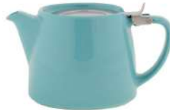
Stump 18 Oz. Teapot 46-7393-White 46-7393-Turquoise 46-7393-Red