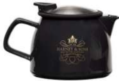
Harney & Sons Bell 16 Oz. Teapot 46-7394-2 16 Oz. with infuser