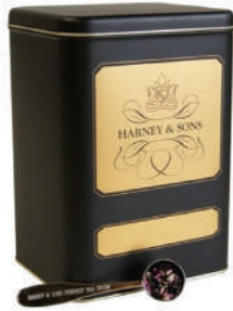
Tea Storage Canister 46-7904-3lb 3lb. Tea Tin