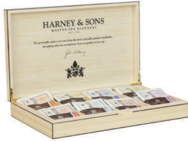
64-7032-7 Bamboo-8 Slot Heirloom Wrapped Sachet Chest-Empty