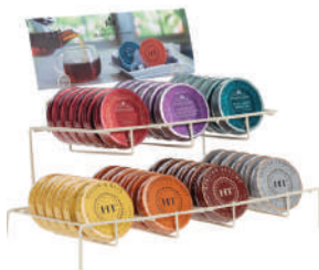
66-7074-1 7 Slot Tagalong