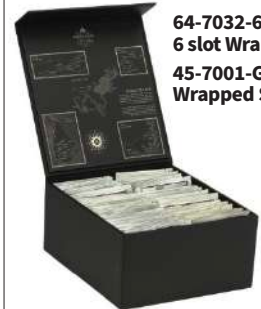
64-7032-6 6 slot Wrapped-Empty 45-7001-G06 Wrapped Sachet Tea Chest-Filled