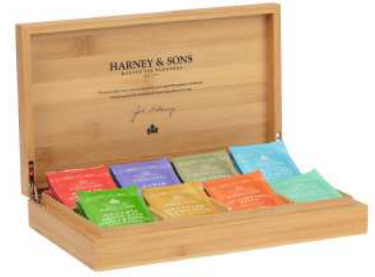
64-7031-1 8 Slot Natural Teabag Chest -Empty 64-7032-10 8 Slot Natural Sachet Chest-Empty