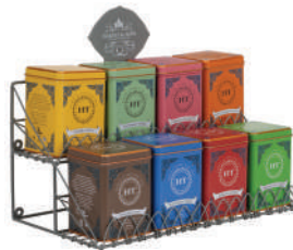
66-7073-1 8 Slot Tin 66-7072-1 8 Slot Wrapped Sachet