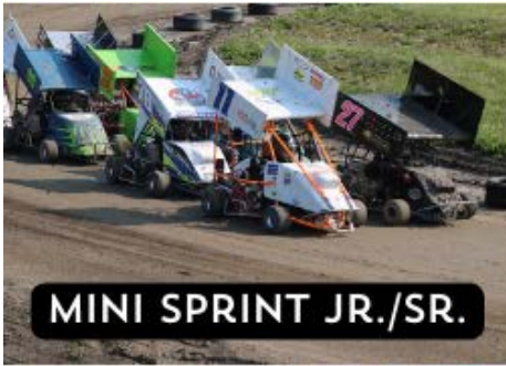
MINI SPRINT JR./SR.