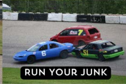
RUN YOUR JUNK