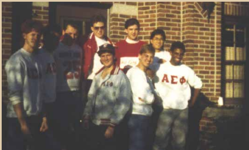
The chartering ceremony of Delta Iota (Longwood) in 1980.