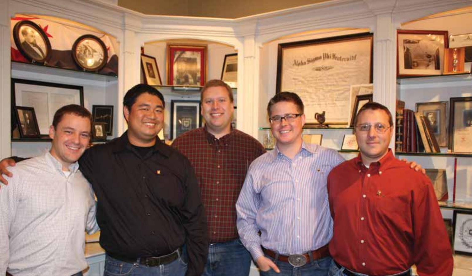
Alumni brothers convene at the Ralph F. Burns Fraternity Headquarters Building circa 2000s.