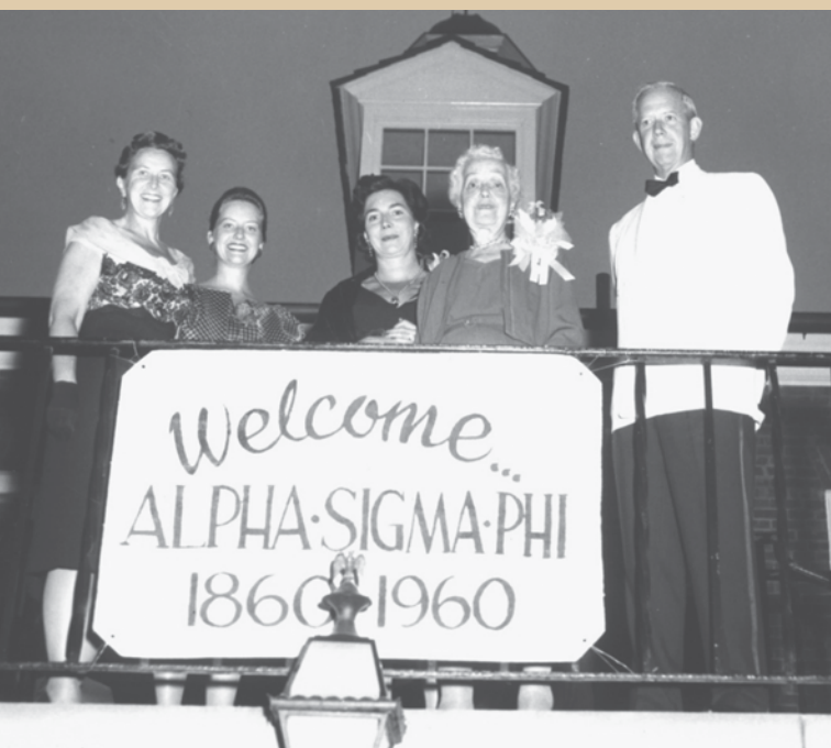
Alumni and guests attend the Fraternity's National Conference in 1960.

and the Third Founding. Through it all, the 'Old Gal' has persisted and given true meaning to our symbol, the Phoenix, as again and again Alpha Sig has risen from the ashes.