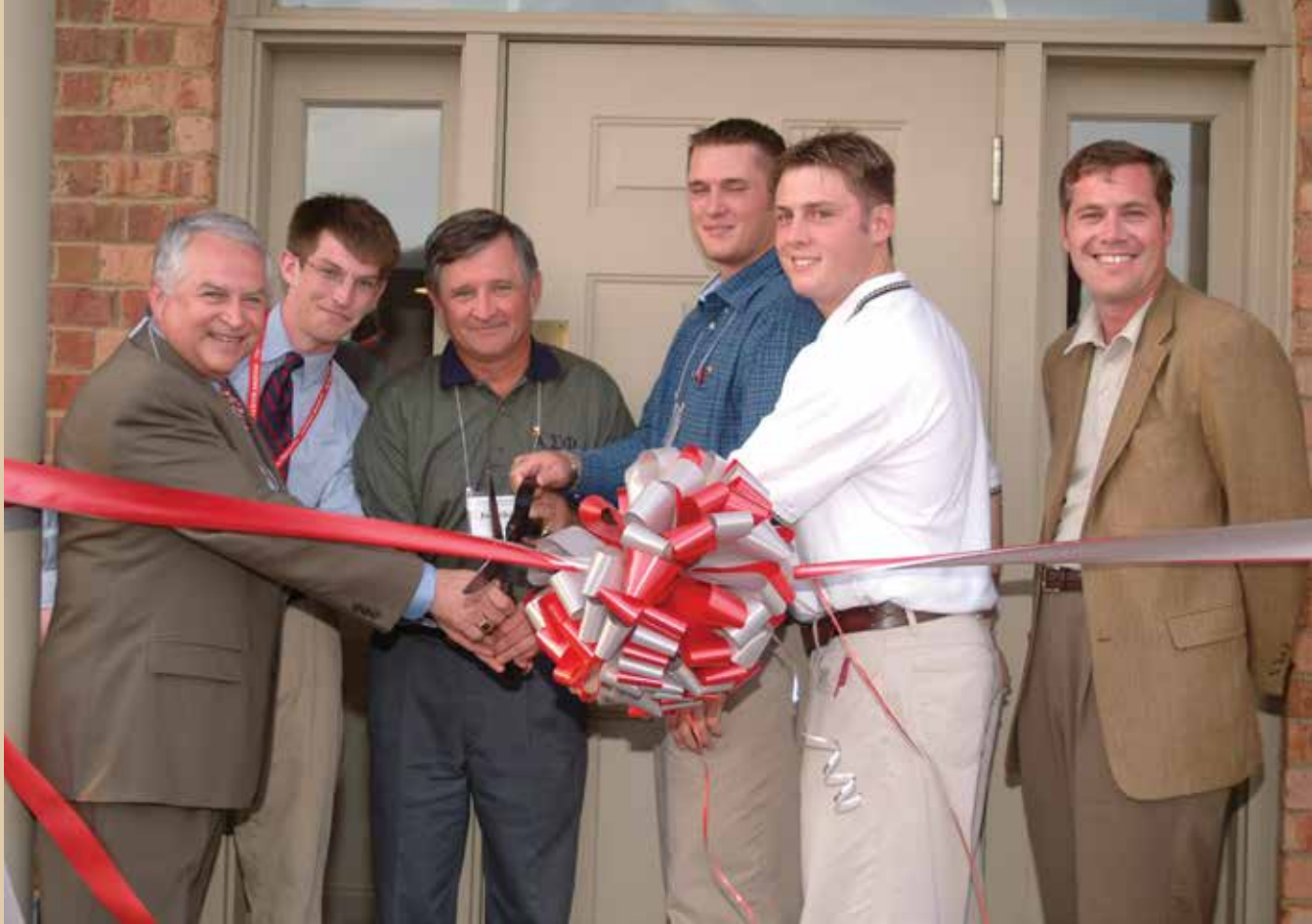
The official ribbon cutting of Alpha Sigma Phi's Ralph F. Burns Headquarters Building in 2002.

Over the coming months, a myriad of information highlighting the accomplishments of our chapters and members will be shared, and chapters and provisional chapters across the United States and Canada will be hosting events on their campus celebrating this milestone. From Values Exemplifications to Road Tours, a team of dedicated alumni volunteers has come together to provide the membership of Alpha Sigma Phi with the ultimate agenda of experiences and information leading up to the celebration of 175 years as a society that has had innumerable positive impacts on campuses all across this continent.