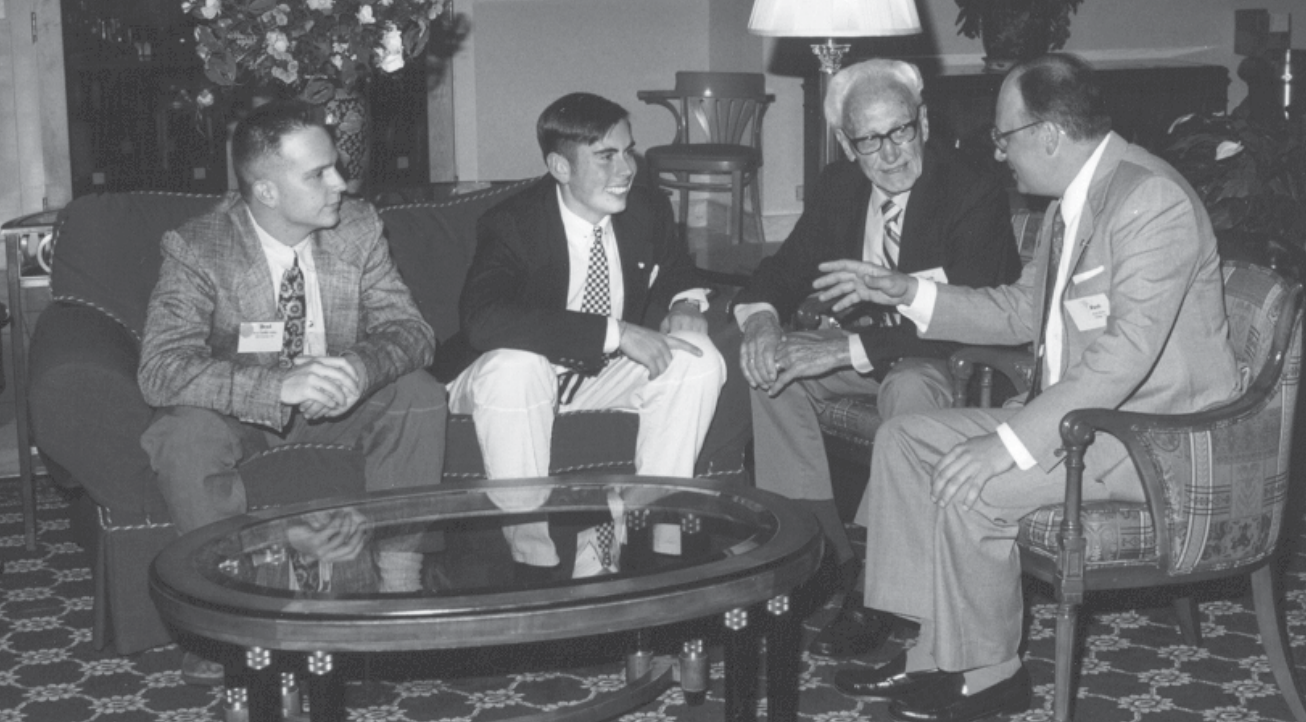
Alumni sharing stories with undergraduate members at a Fraternity event.

that are active today. Such growth is a testament to the work of our staff at Headquarters, as well as the drive and dedication of our undergraduate members and alumni volunteers.