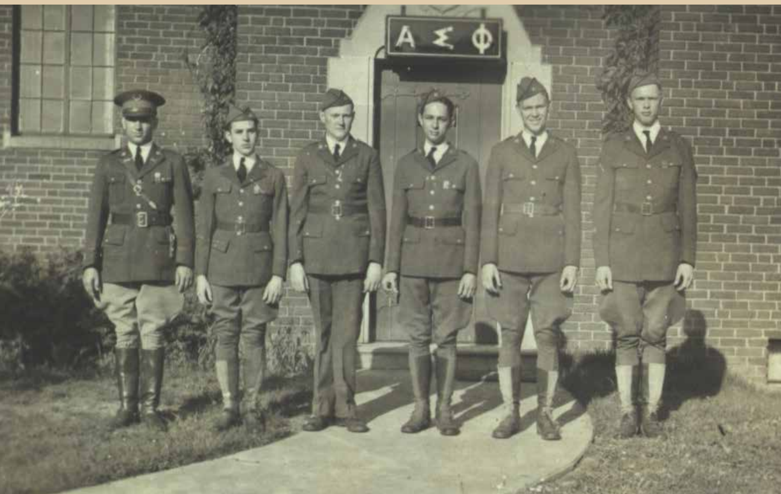
Brothers from the Phi Chapter at Iowa State University who served in World War II.