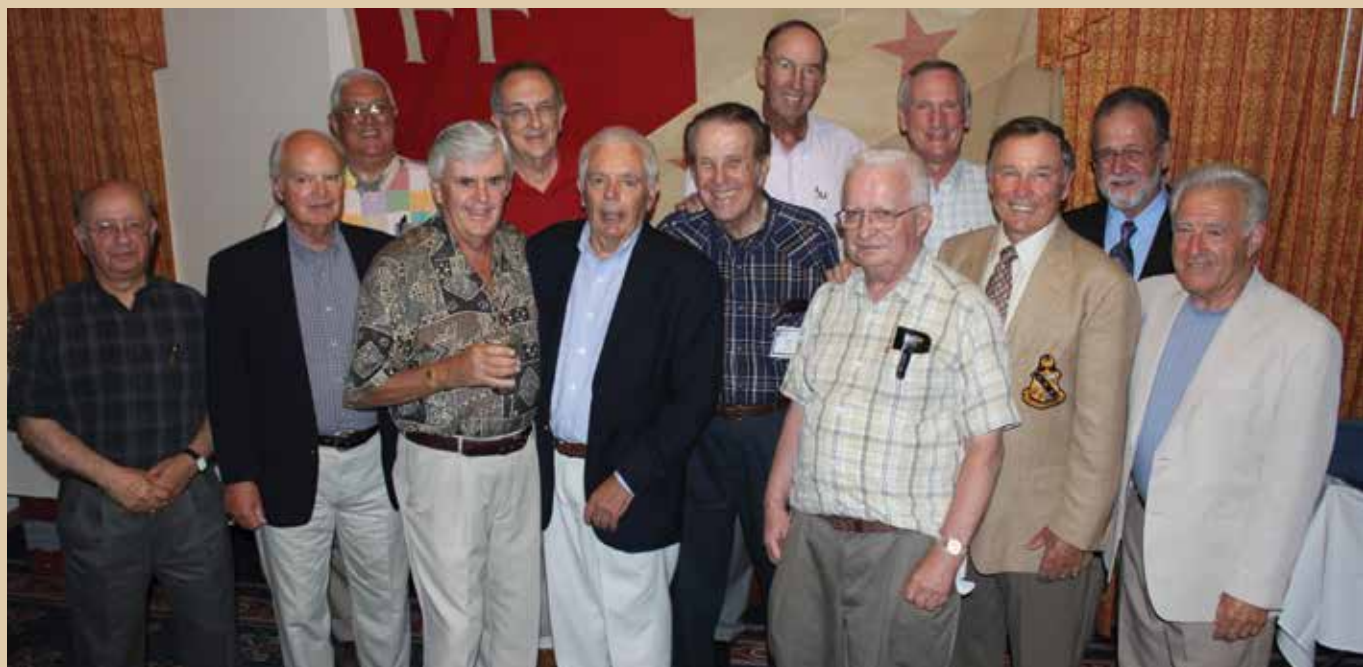
The alumni of Gamma Gamma (Connecticut) gather in 2010.

Starting with Elevate and all the way until Founders Day 2020, all Alpha Sigs should plan to celebrate this amazing accomplishment in a variety of ways; whether it be with brothers in the local area, back on campus with the undergraduate chapter or at regional events hosted by Fraternity Headquarters. As the 10th Oldest Fraternity in the nation, few have been able to accomplish this feat. Undergraduates and alumni alike are encouraged to