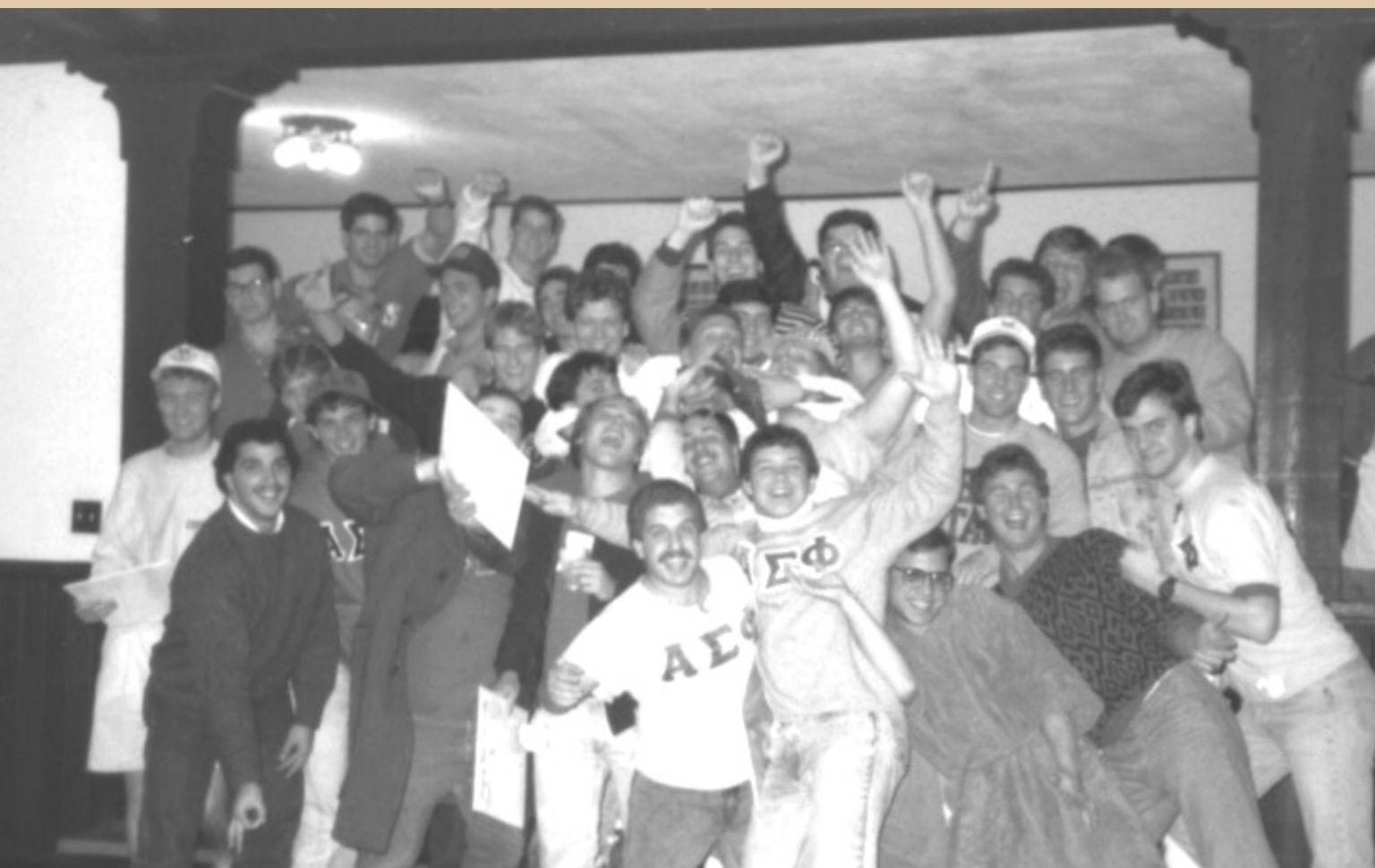
Undergraduate members from Iota (Cornell) circa 1990s.