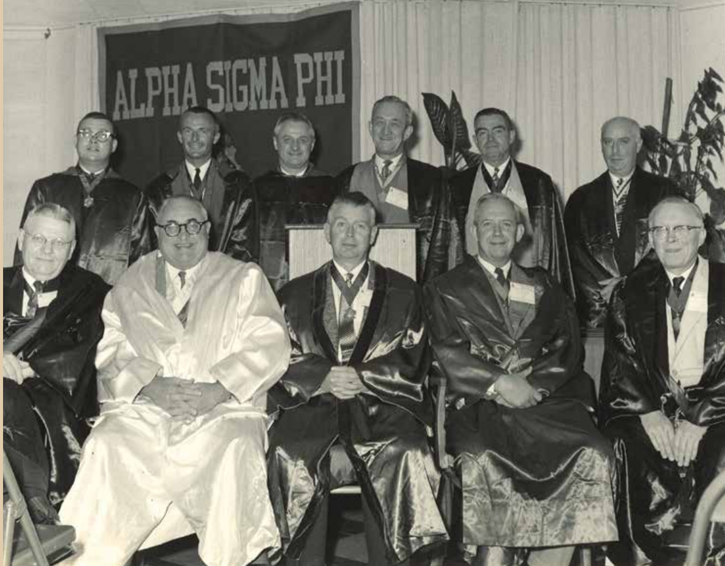
Alpha Sigma Phi's Grand Council circa 1956.

stay in-tune with the updates provided by the 175th Committee, Headquarters and chapters so that all are able to partake in the celebration. When Alpha Sig turned 100 years old, our country was just coming out of WWII. Barely able to sustain itself, a merger with Alpha Kappa Pi was drawn up, which allowed the 'Old Gal' to grow enough to survive through the middle of the 20th century. The Organization endured the turbulent times of the 1960s, '70s and '80s – aided by a Third Founding Campaign in 1984 – and as the calendar turned to the 1990s it became time to prepare for the 150th Anniversary of Alpha Sigma Phi.