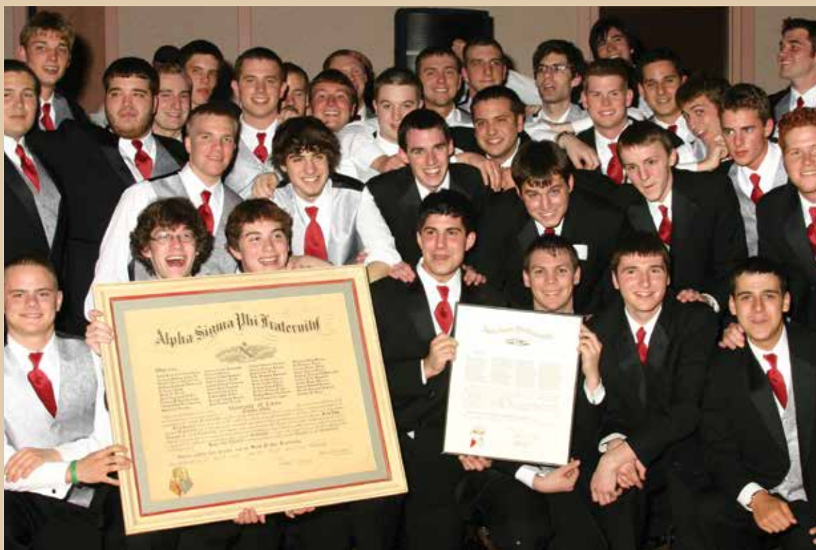
The re-chartering ceremony of the Beta Rho Chapter at the University of Toledo in April 2006.

country as we march towards Grand Chapter 2020 and ultimately December 6, 2020. These updates and events are not solely geared towards the 175th Anniversary, but also towards highlighting, remembering and celebrating the some 86,000+ total initiates within the Mystic Circle between our 243 chapters (176 are currently active chapters or provisional chapters).