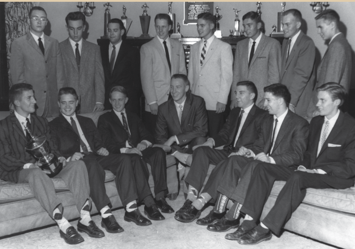
The undergraduate men of Eta (Illinois) circa 1960s.

how far we have come as a fraternity, but the current state of affairs and the bright future that lays ahead of us. All of it leading up to the official celebration at Grand Chapter 2020 in Hartford, Connecticut. An event such as this calls for the attention and participation of its membership, and it is the hope of all of those currently involved in the planning of the 175th