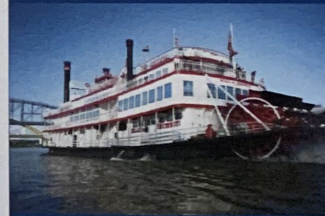
Enjoy a BB Riverboats Sightseeing Cruise