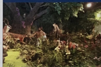
Visit to the Amazing Creation Museum!