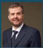
Dr Ben Gauntlett, Disability Discrimination Commissioner, Human Rights Commission