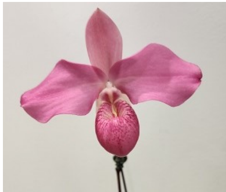
Lorraine Snyder's Phrag Acker's Berry (Waunakee Sunset x kovachii #2)