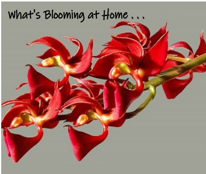
What's Blooming at Home . . .

Lynn West's Morm. badia 'Yellow' x Morm. andreetae 'SVO' AM/AOS first bloom seedling