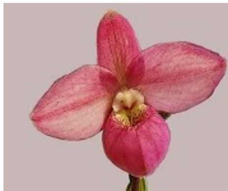
Chuck Acker's Phrag Acker's Ballerina (Icho Tower x fischeri )