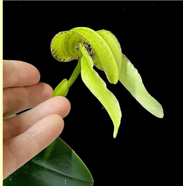
Ken Cameron's plants and photos