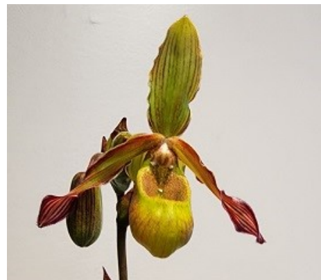
Chuck Acker's Phrag sargentianum