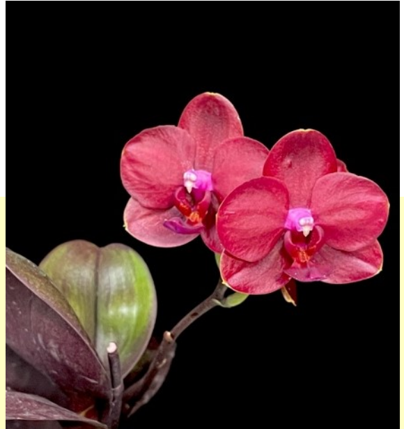
Phalaenopsis Jordon Winter (Citrus Candy x Krull's Red Bird)