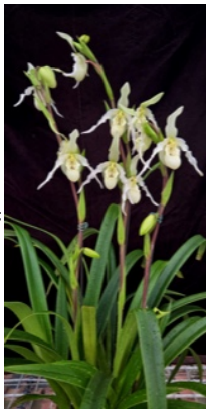
Meg Graham's Phrag Silver Eagle 'Pink Frost' AM/AOS ( schlimii x czerwiakowianum )