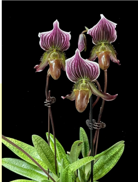
Paphiopedilum Faire-Maud ( fairrianum x Maudiae )