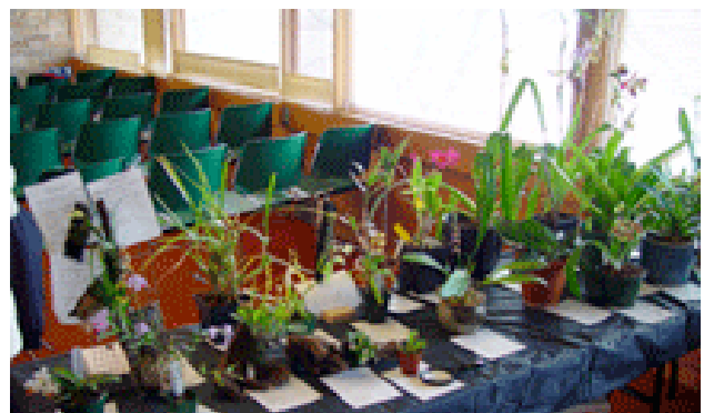
Plants for Ribbon Judging at the March Guild Meeting.