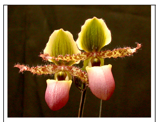
of Paphiopedilum liemianum

The Spring MAOC will be held in Chicago April 27-29, 2007. The topic for discussion at the Sunday morning breakfast hosted by the Affiliated Societies Committee will be "Challenges Facing Local Societies." Register in advance. Information can be obtained by email <a href="maioc2007chi@earthlink.net">maioc2007chi@earthlink.net</a>. Check the MAOC web site for information & registration forms: <a href="maioc2007chi@earthlink.net">www.midamericanorchids.org</a>.