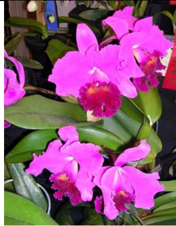
BLC Ronald Hausermann 'Carl', entered by Acker's