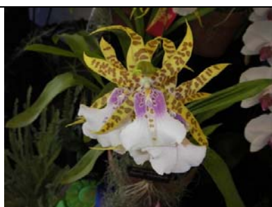
OGG display at the Illinois Orchid Society Show; above Odontoglossum type Orchid