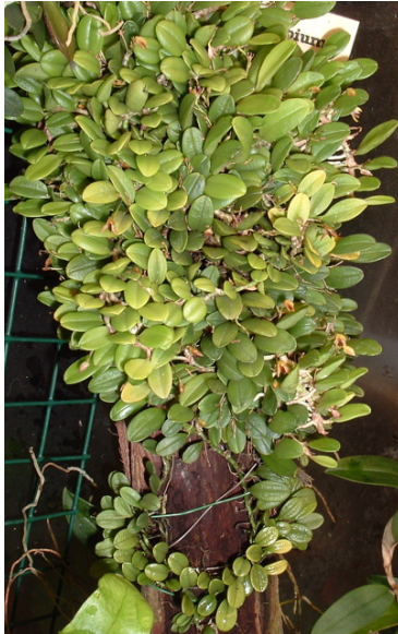
The flowers on this Pleurothallis seratalobium can be measured in millimeters