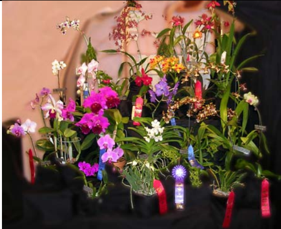
OGG display at Blackhawk Orchid Society Show