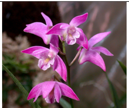
Photograph by Rich Narf of Dendrobium kingianum