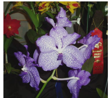
Vanda Sansai Blue 'Acker's Pride', entered by Ackers