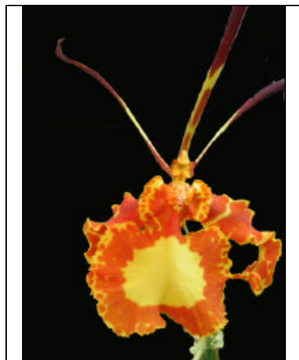
Psychopsis Mendenhall 'Hildos'

Submit your photos to be included in the newsletter. Every month we want to include a gallery of photos to enjoy. Email your photos to Brook ( orchids@tinamouppottery.com ) and Denise ( jrbaylis@tds.net )