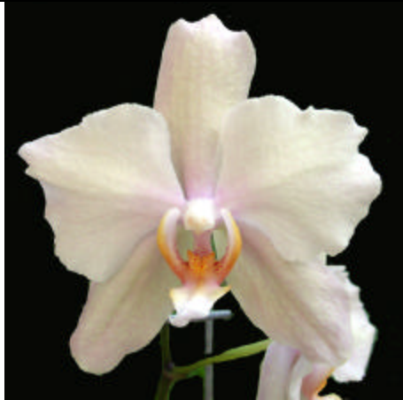
Photograph by Svetlana Kot