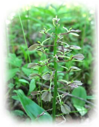
Photograph by Svetlana Kot of Liparis

THANK YOU to Scott Weber for hosting our summer picnic. The drive into the Baraboo hills was gorgeous. The weather was perfect with sunshine and a breeze. Scott provided sausages purchased at the farmer's market the day before the picnic. The potluck was excellent with a good mixture of dishes. Best of all, orchid viewing was superb. The Showy Orchids (seeds harvested from three regions in the USA) started blooming about two weeks early this year. They looked very happy