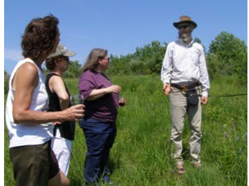
Preparing to walk through the Baraboo Hills at Bluestem farm in search of the Lily leaved twayblade, which we found. The orchid was small and well camouflaged.