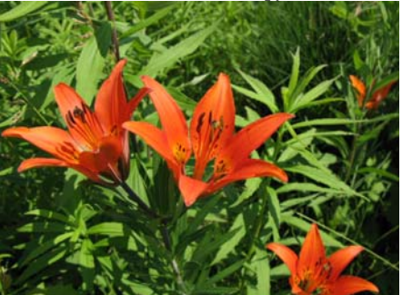
Wood lily (Lilium philadelphicum)

The home of the salvaged orchid seeds planted Feeding and nourishing our bodies before we under a 60% sun blocked canopy