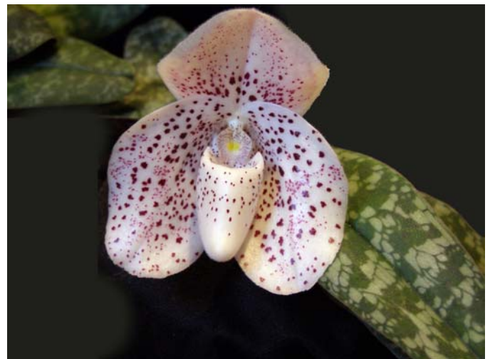
Paphiopedilum Conco Bell ( Paph Bellatulum x Paph concolor)