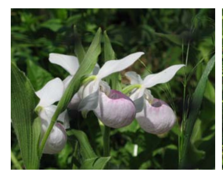
A gorgeous Cypripedium reginea

The home of the salvaged orchid seeds planted Feeding and nourishing our bodies before we under a 60% sun blocked canopy