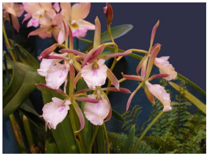
Brassavola nodosa x Enc cordigera