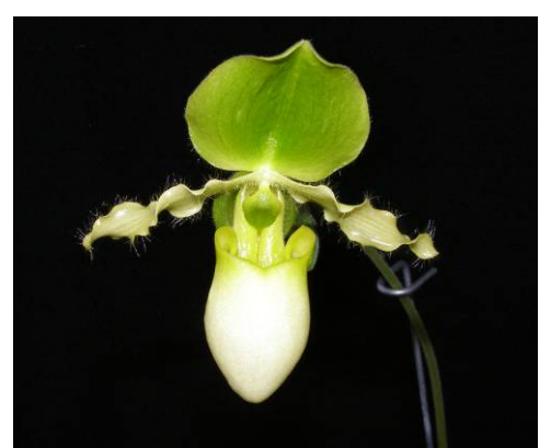
Paph primulinum v. album

The next thing the OGG guild hopes to accomplish is to look at the various volunteer opportunities available in OGG and then attempt to define the responsibilities of each person in that position. Thus far that committee has not been formed so we welcome the input of anyone