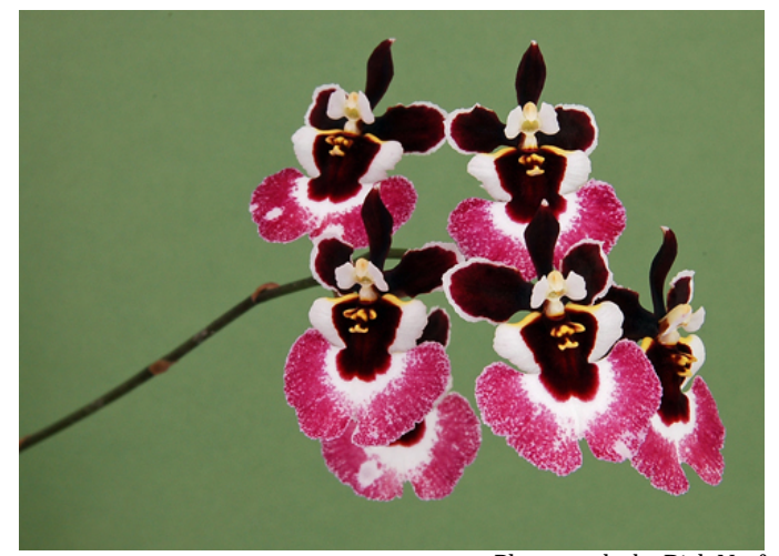
Dancing Ladies, Oncidium Ralph Yagi 'Jon'