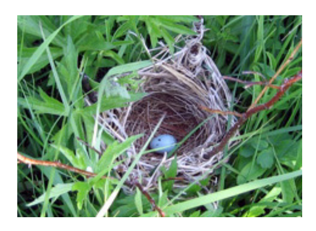
Bird nest found by Elaine Malter