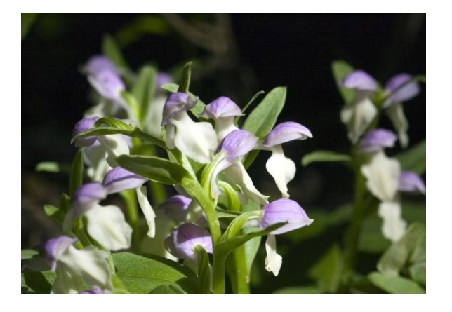
Jeff Baylis this photo last month of an orchis spectabilis

The Ridges Sanctuary is a 1,440 acre natural area