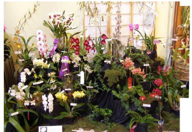
OGG Exhibit at Illinois Orchid Society Show

There were three lectures at the hotel on Sunday. I missed the first one on Huntleyas so I