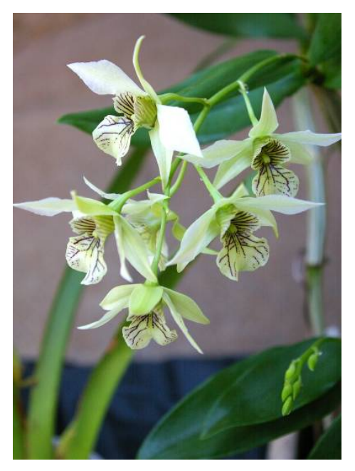
Above, Den. Johnsoniae x convolutum: below Coml. Wildcat 'Green Valley'

... your only "passengers" in the car are none other than orchids.