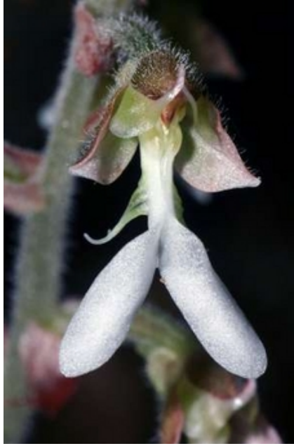
Anoectochilus annamensis (close-up)

The rainforests of the Central Annamites likely existed as continuous undisturbed forest cover for thousands of years, and, as a result, offer unique habitats for many species, said WWF experts.