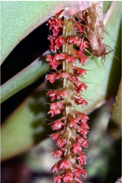
Oberonia huensis (close-up)

Three of the new orchid species are entirely leafless, a rarity even among orchids. Containing none of the chlorophyll or green pigment commonly found in plants, these orchids live on decaying matter like many fungal species.