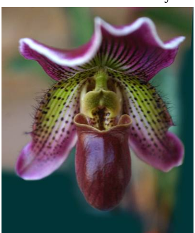
Paph Juno fairienanum x callosum