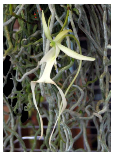
Polyrrhiza lindenii or Ghost Orchid grown by Oak Hill