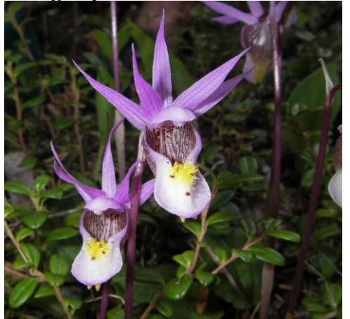
Calypso bulbosa

I try to cultivate healthy orchids at home while my husband who is a plant pathologist focuses on the diseases of plants at work. Much to my surprise, this summer he came back from his annual fishing trip in northern Saskatchewan on the Churchill River,