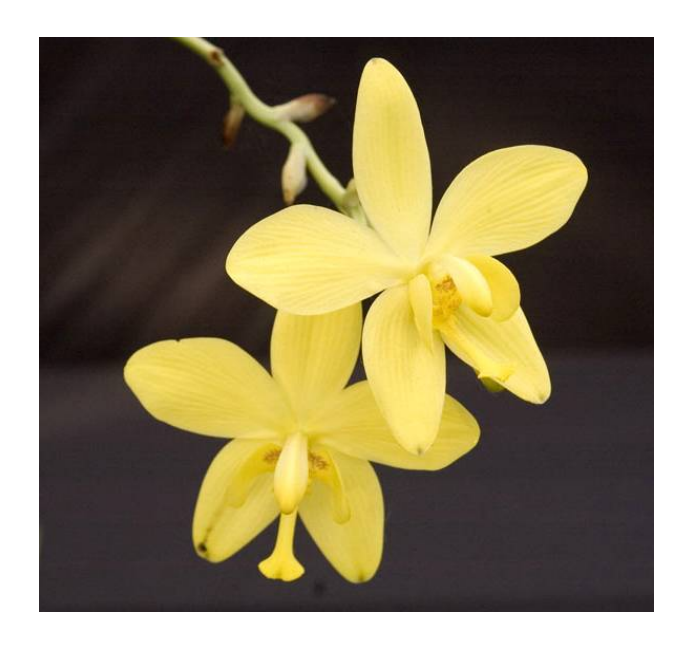
Spathoglottis gracilis grown by Sandy Delamater