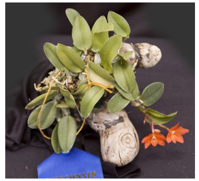
Sophronitis cernua grown by Svetlana Kot