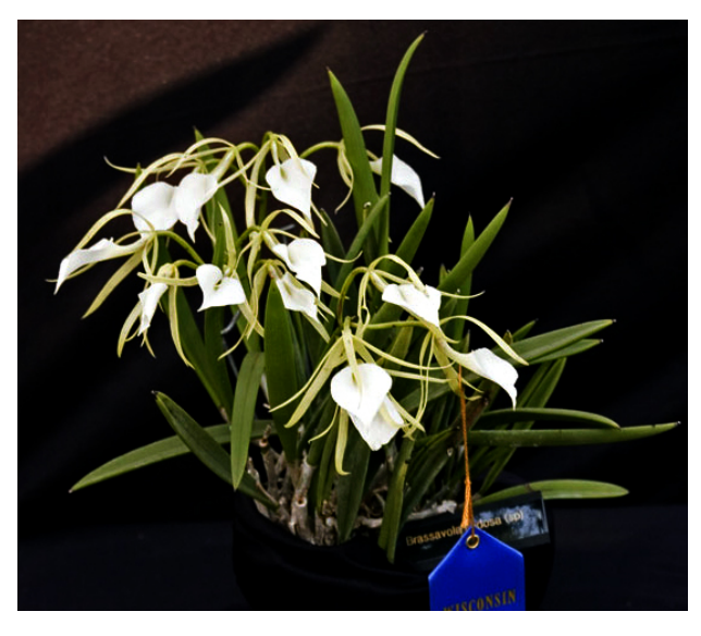
Brassovola nodosa Grown by Wayne King