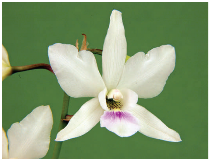
Below from the Bolz Conservatory, on the left is a Bulbophyllum grandifolium ; and on the right a Phalaenopsis sumatrana