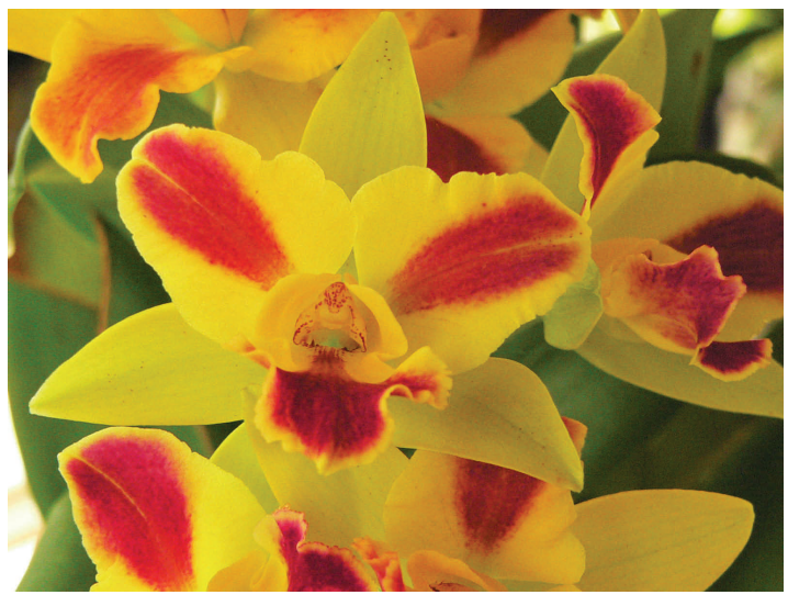
Potinara Burana Beauty

Since the 2003 Awards Policy revision did not specifically state that it replaced all pre-existing policy, it is assumed that all prior Awards Policies, not addressed in the 2003 revision, remain in place. One issue this raises is that an AOS award is now worth the same number of points as a Best of Class award. This has not been a problem because AOS award points have not been earned by Guild members – but could be an inequity at some future time.