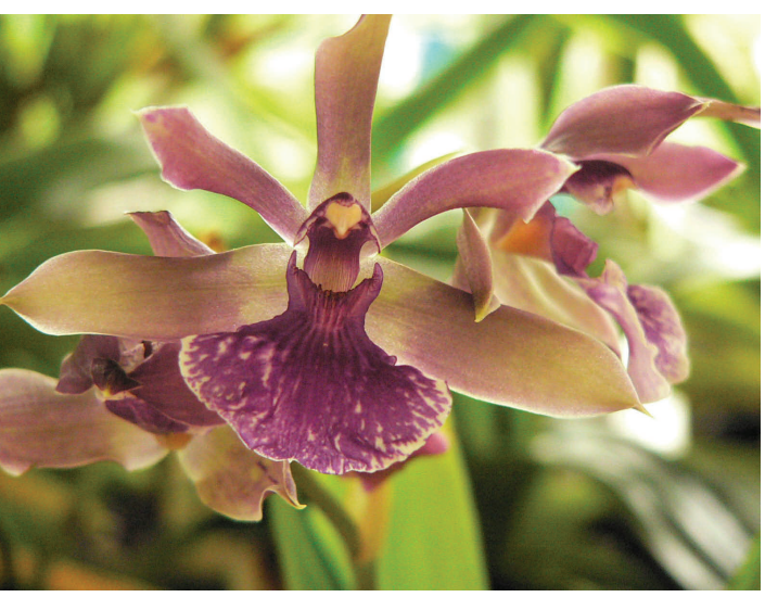
Zygopetalum 'Cardinal's Roost'