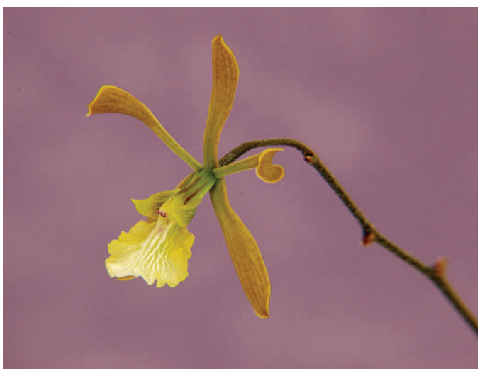
Above is an Encyclia aspera ; below is a L. anceps alba x Dialaelia Snowflake_ Mendenhall'