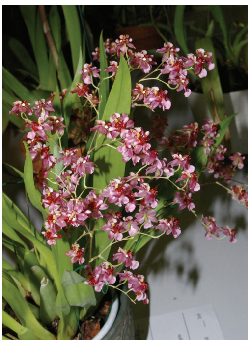
Oncidium Twinkle 'Red Fantasy" earned a first place ribbon for Meg McLaughlin last month.