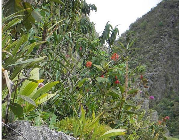
Lush vegetation clings to the steep slopes of the Andes

races. We had many steps to negotiate at this place which