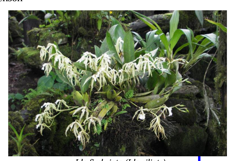
Ida fimbriata (Ida ciliate)