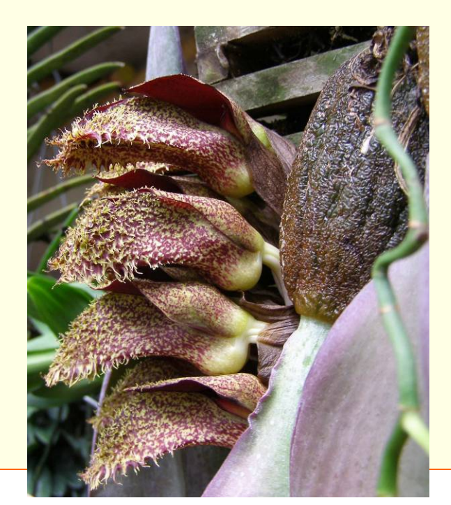
Orchid Grower, June 2008, page 5 of 8

On the left is a Dendrobium from Sarawak; below right is a Bulbophyllum phalaenopsis from New Guinea, and bottom left is a Bulbophyllum frostii