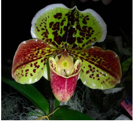
Paph (Suzie Del x Revelry) (received first)