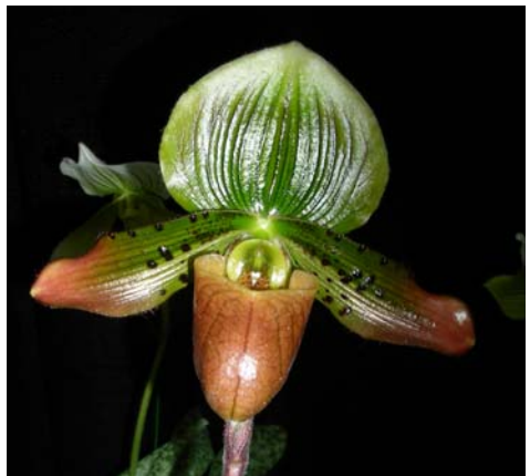
Paph. Jungle Fever 'Green Fire' (received HCC) Phanatics