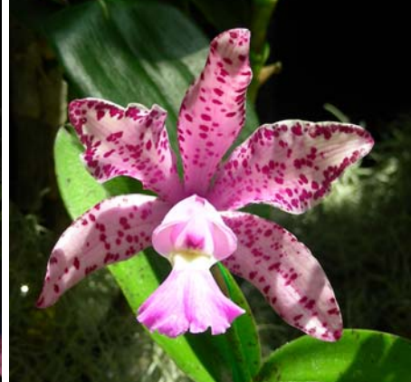
Cattleya Summer Spots 'Carmela'