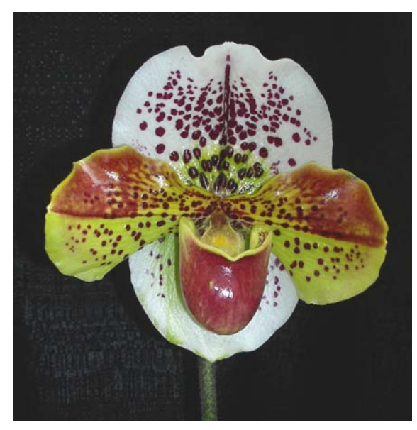
Paph. (Leopard Spot x Denen)