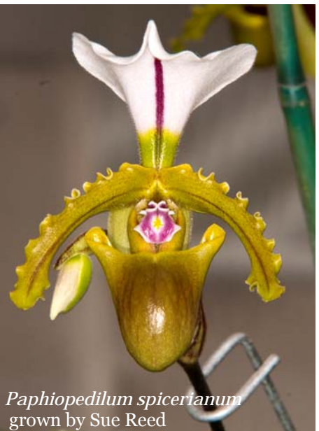
Orchid Grower, December 2009, page 6 of 7