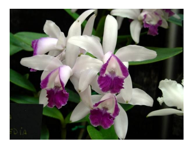
Cattleya intermedia orlata coerulea