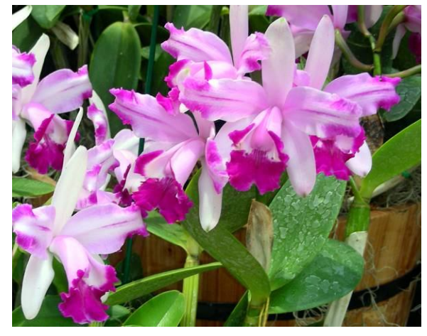
Cattleya intermedia flammea orlata