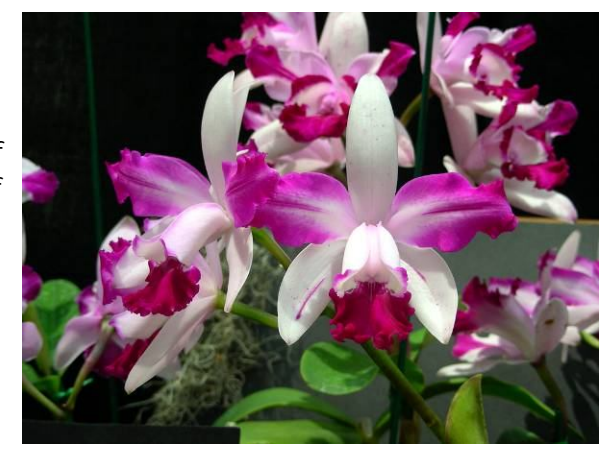
apacz Cattleya intermedia aquinii orlata # 2