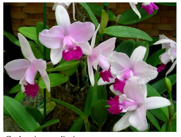
Cattleya intermedia tipo