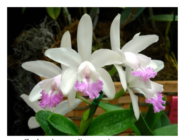
Cattleya intermedia amnesia