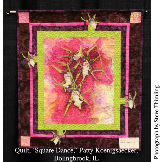
Orchid Grower, March 2010, page 7 of 8