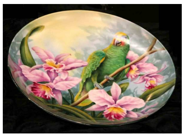
This plate was painted by Randy Wollet, Capitol Artists, from Jefferson WI