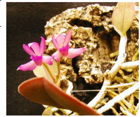
Meiracyclium trinastum

Orchidariums are relatively expensive (but so are orchids.) This orchidarium has allowed him to bloom a variety of orchids.