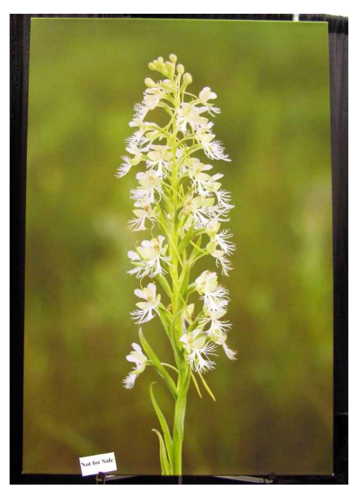
Blue ribbon winner 'Eastern Prairie Fringed Orchid,' Large photograph on fabric by Gary Shackelford