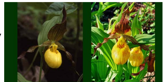
Woodland-grown parent on left, nursery-grown offspring on right. Light intensity may affect color and degree of red speckling.