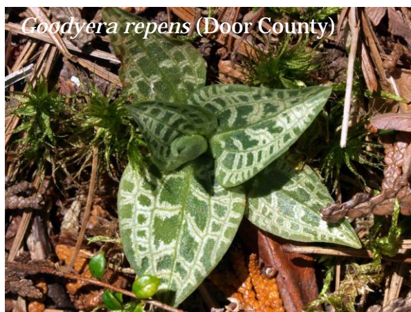
Goodyera repens (Door County)