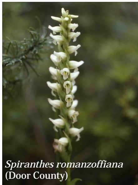
Spiranthes romanzoffiana (Door County)