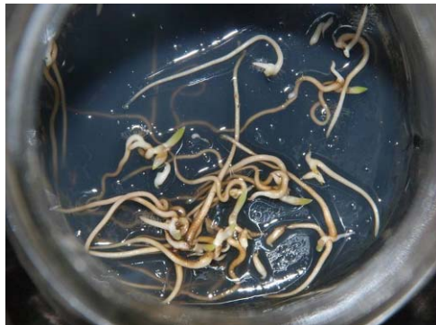
Healthy C. parviflorum seedlings