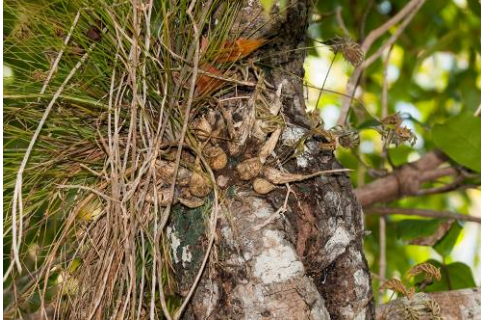
Encyclia tempensis , possibly freeze damage