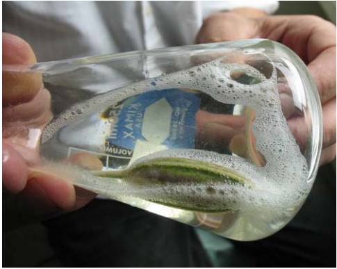
Disinfecting green seed pod