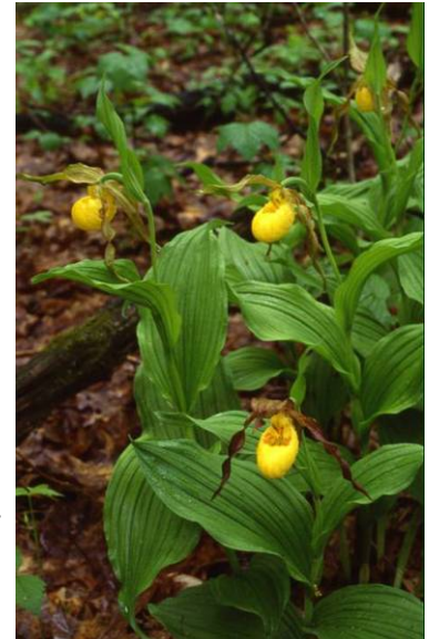
Sauk County plants with two color forms side-by-side

This fall will be the OGG 25th Anniversary. We were incorporated in 1985. We should have a Celebration!!! Please submit to me any ideas that you might have for this occasion. We will form a committee and have this celebration this fall.