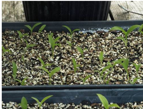
C. parviflorum seedlings second summer