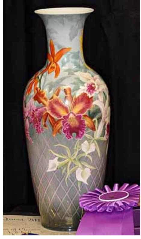
Orchid Vase by Randall Wollet of Capital Artists, First Place and Best of Class