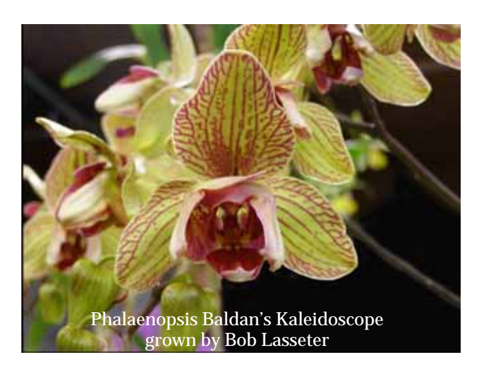
Orchid Growers' Guild, April 2011, page 6 of 8