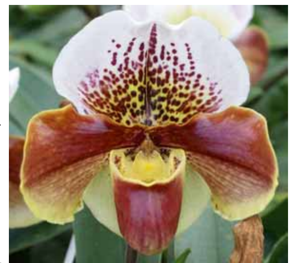
'Indomitable' (above), and 'Redoubtable' (below are clones of Paphiopedilum Winston Churchill