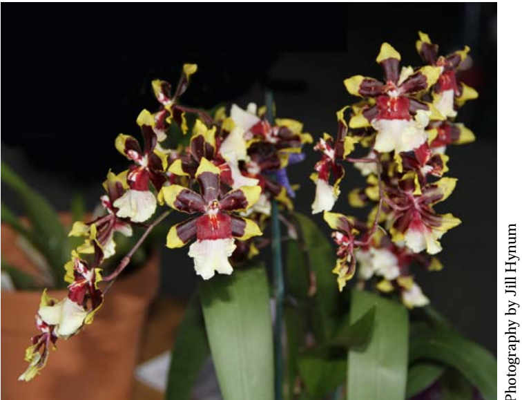
Colmanara Wildcat 'Rainbow'