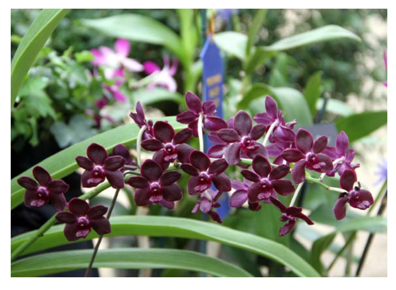
Vandachostylis Colmarie (Vandachostylis Sri-Siam x Rhyn-chostylis gigantea )