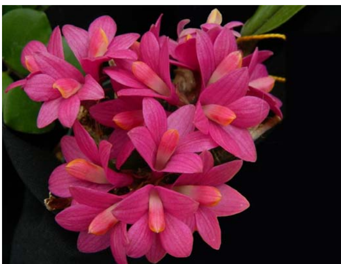
Dendrobium Laevifolium common name Shiny Leafed Dendrobium from the southwest Pacific Orchid Growers' Guild, October 2011, page 7 of 7