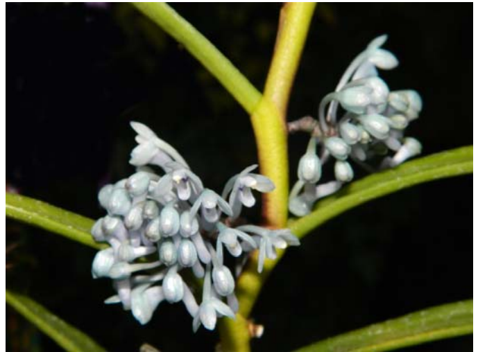
Cleisocentron merillianm , from Borneo