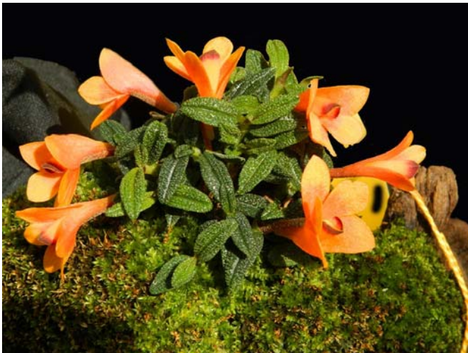
Dendrobium cuthbertsonii cool-growing endemic to New Guinea. Blooms can last up to 10 months