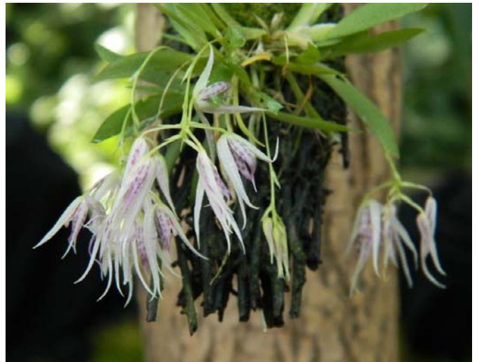
Macroclinium species, from Ecuador