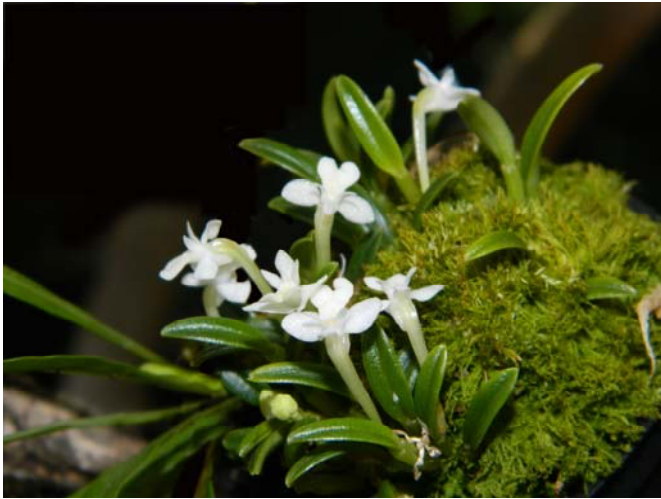
Cadetia chionantha , from New Guinea