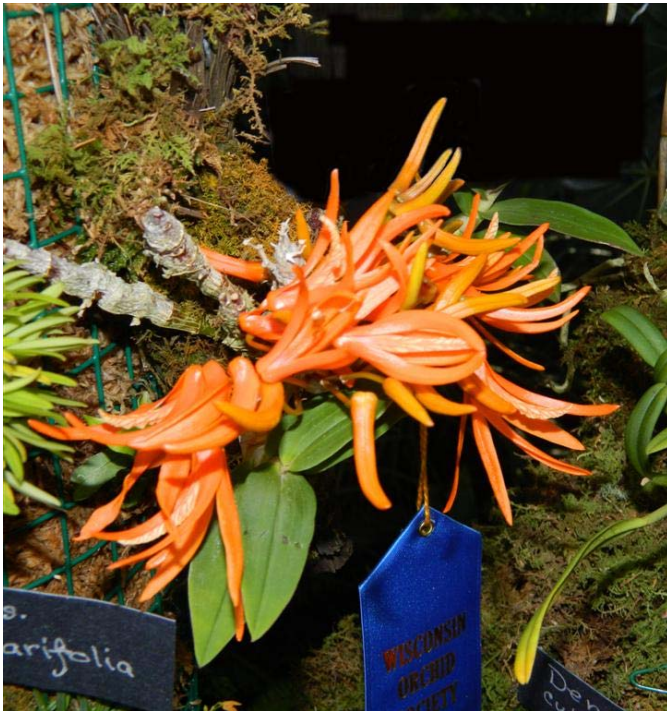
Dendrobium lamyaiae 'Silas', deciduous epiphytic orchid from Southeast Asia. The flower can outsize the plant.