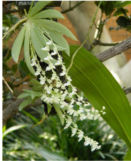
Ornithocephalus manabina , common name The Manabi Ornithocephalus [a Department in Ecuador]. Found in Ecuador as a hot growing epiphyte