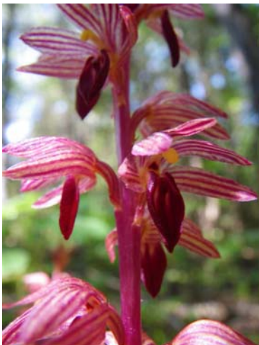
Close-up of Striped Coralroot ( Coralhiza striata var. striata )