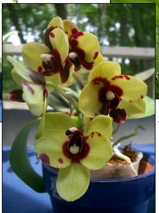
Cypripedium reginea alba grown by Jill Hynum