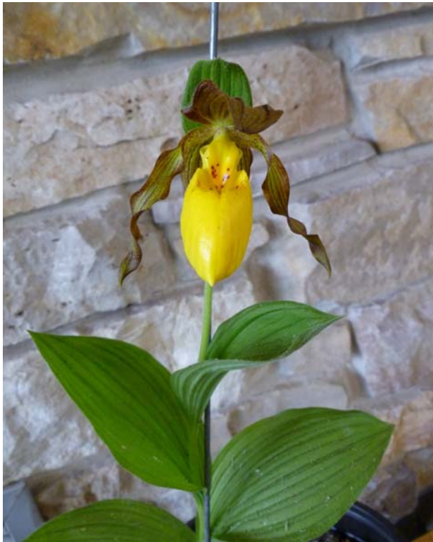
This yellow Cypripedium was shown by Jill Hynum