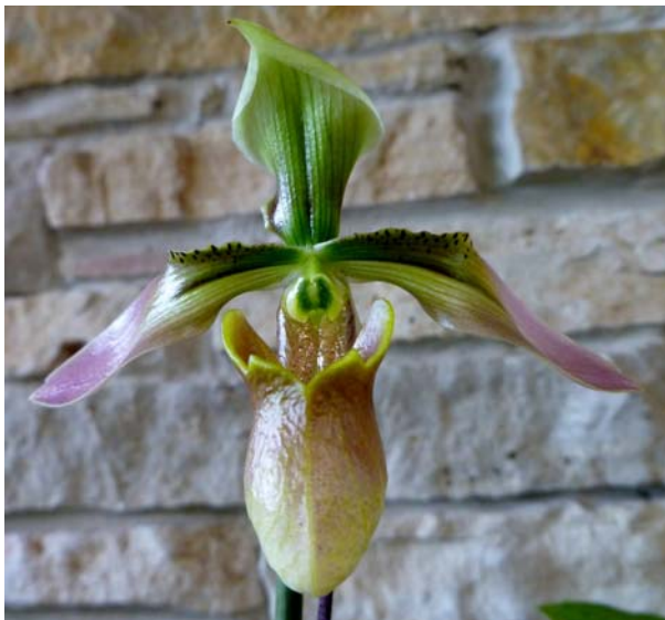
Paphiopedilum appletonianum (appletonianum 'Moment' x appletonianum 'Kopua Ben'), shown by Lorraine Snyder