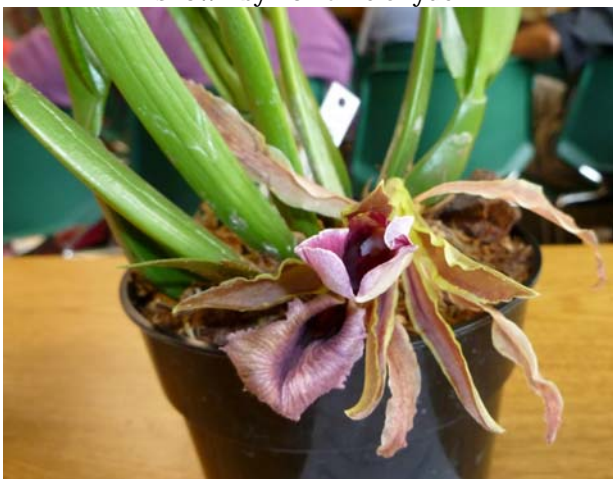
Sandy Delamater showed this Trichopilia x Ramonensis

Orchid Growers' Guild, June 2012 page 4 of 5