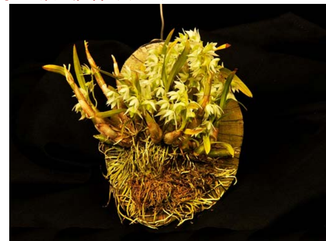
Dendrobium eriaeflorum. Certificate of Cultural Merit. Shown by Walter Crawford, Wisconsin Orchid Society

Orchid Growers' Guild, March, 2012 page 5 of 8