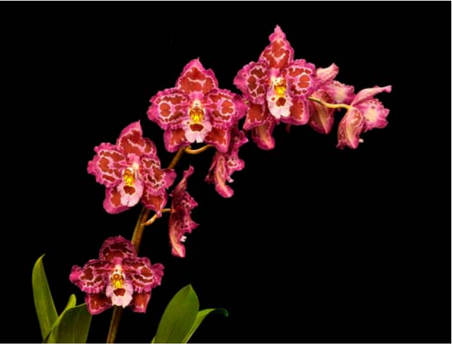
Odontioda Teighmore Rouge Bouillon x Aviewood. Highly Commended Certificate. Shown by New Vision Orchids

Orchid Growers' Guild, March, 2012 page 5 of 8