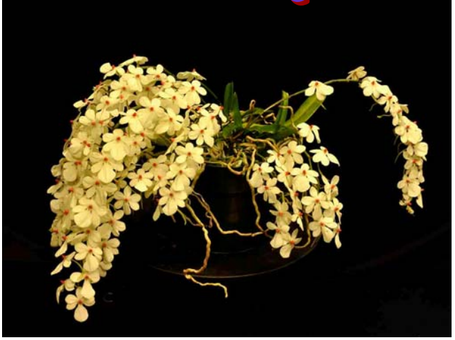
Aerangis luteo alba var Rhodosticta. Certificate of Cultural Merit. Shown by Michel Orchid Nursery.