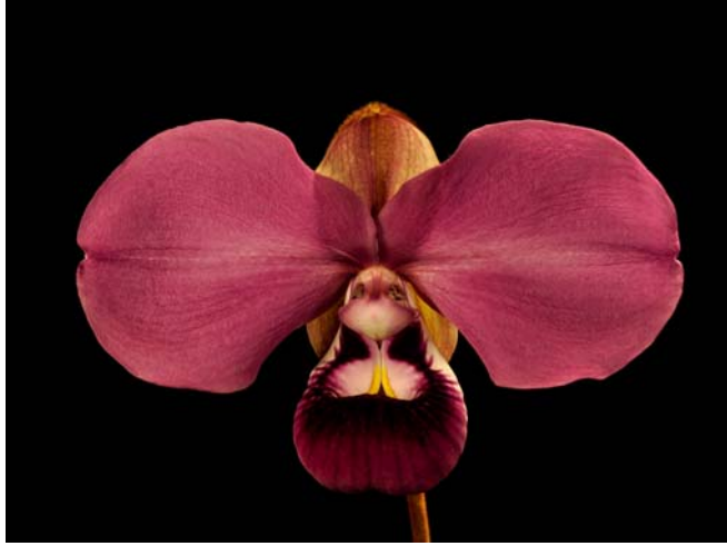
Phragmipedium kovachii 'Purple Cow.' Award of Merit. Shown by Orchids Limited