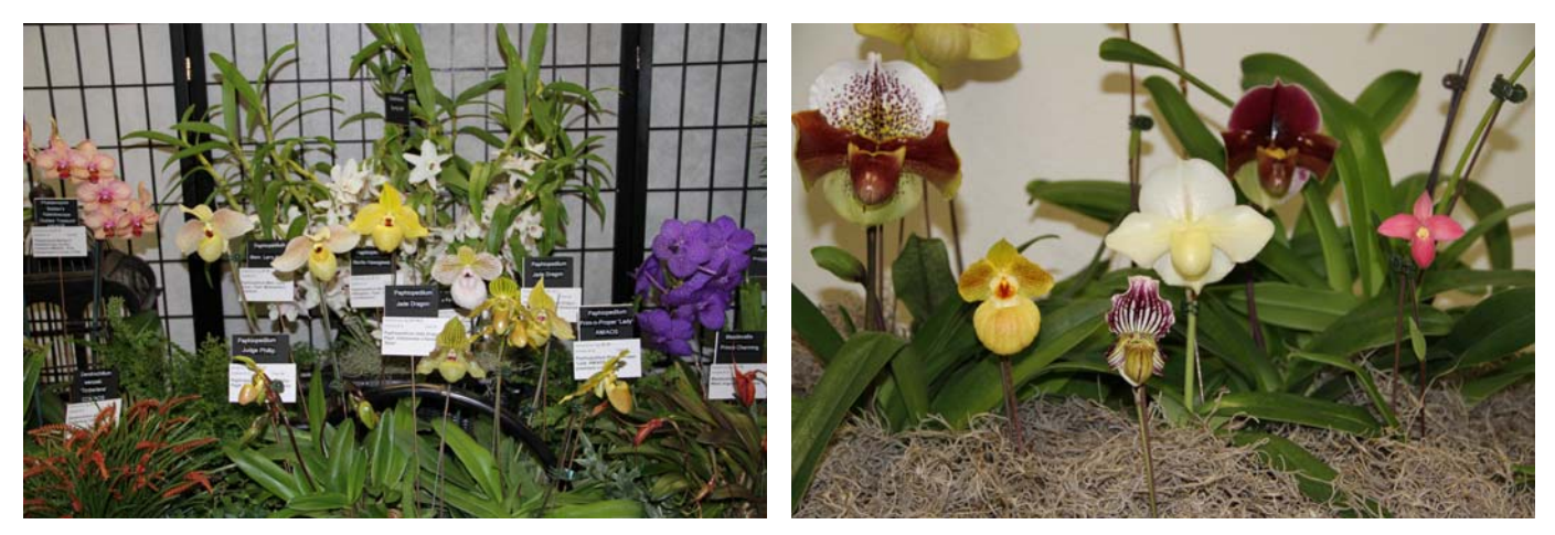
of some other exhibits at OQ 2012