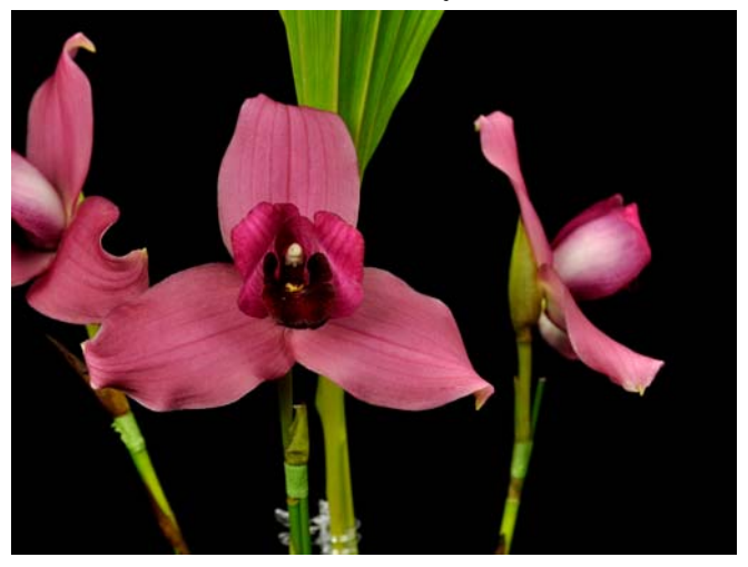
Lycaste Kawabunga 'Revlon Kiss.' Award of Merit. Shown by Orchids Limited