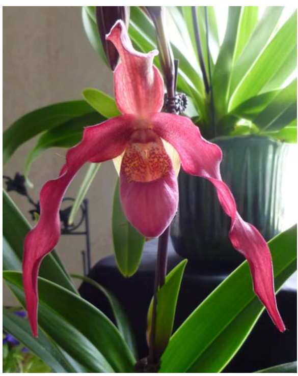
Sue Reed's Phrag (Rosalie Dixler 'FV' AM/AOS x caudatum var sanderae 'Select')