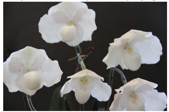
Paph (Gray's 'Sandstone' x Mystic Isle 'Hysinying' BM/TPS)

There was also ribbon judging. The first of two plants of note was Sue Reed's Paph (Gray's 'Sandstone' x Mystic Isle 'Hysinying'