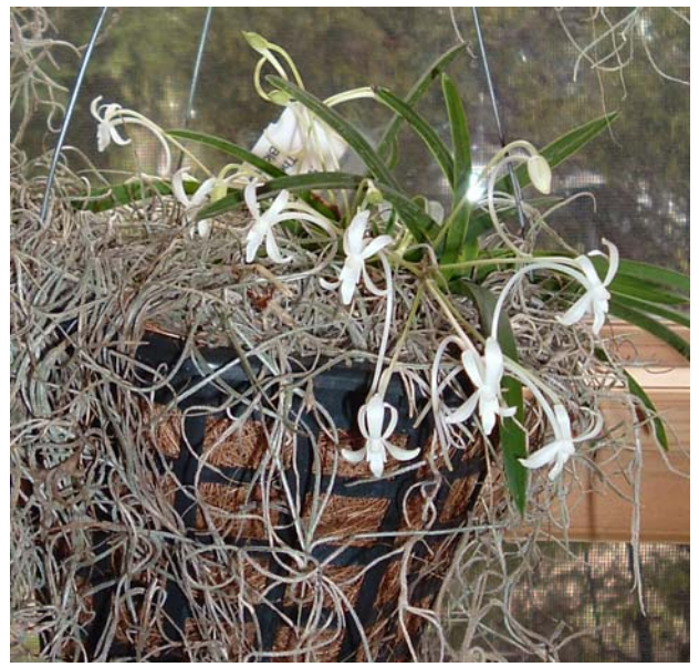
Neofinetia falcata 'Fugaku'

basket lightly with coconut husk (hanging basket liners). It pulls apart easily so you can get a nice thin lining if you prefer that to the heavier one. It works well for me. I like to top it all off with some live Spanish Moss. It looks pretty hanging down around the plants in my windows. Some baskets I just set in a saucer like I do with clay pots. They do just as well as the hanging ones if they get as much light. In fact, I potted a Neofinetia