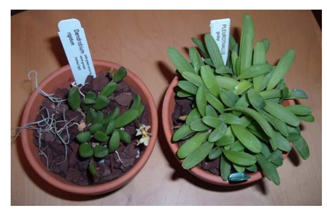
Dendrobium rigidum and Pleurothallis grobyi

So water frequently at first, and a couple of months down the road you'll look at your orchids and they will have changed. They'll look healthier! Give them six months and you won't know they are the same orchids. No kidding, this stuff really makes them 'shine' in many ways. An example: in Sep-