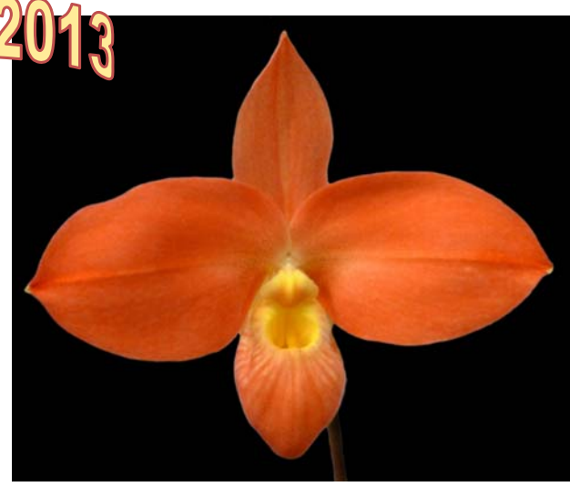
Phrag Fritz Schomburg (besseae x kovachii), Second Place , Orchid Inn