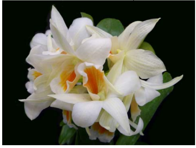
Den Frosty Dawn (Dawn Marie x Lime Frost), Batavia