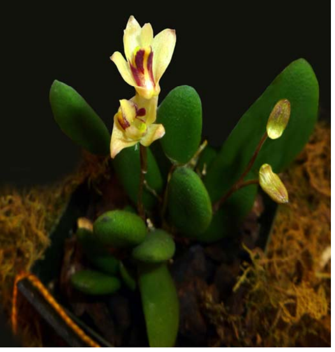
Dendrobium rigidum , Third Place , grown by Rich Narf