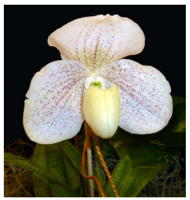
Paphiopedilum niveum 'alba' x In Charm White 'Chao Chao' BM/TPS, Second Place , Marcia Whitmore