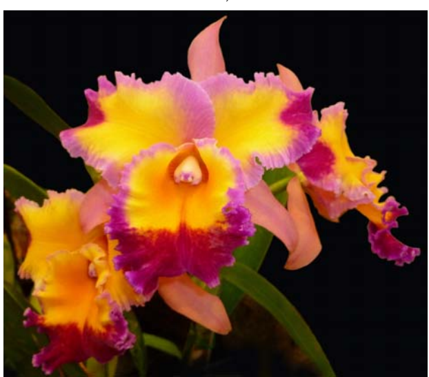
Rhyncholaeliocattleya Dick Smith 'Aloha Spirit' (Rlc. Hisako Akatsuka x Rlc. Hawaian Lightning), First Place , Natt's Orchids