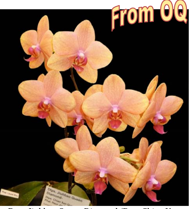
Dtps Jiuhbao Queen Diamond (Dtps Chian Xen Queen x Phal Haur Jin Diamond) from Eastern Iowa Orchid Society