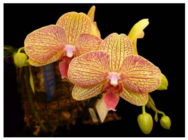
Phal KV Beauty '613' (Salu Poeker x Chih Shang's Stripes), Batavia

Orchid Growers' Guild, March 2013, page 5 of 10