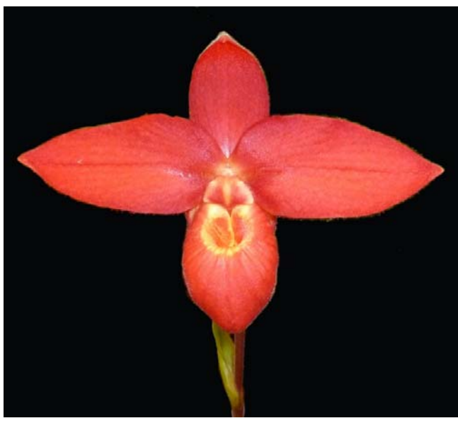
Phrag Jason Fischer 'Red Rocket', First Place and BOC

Classes 93 through 96 - Lycaste, Maxillaria, Zygopetalum, Catastetum, Cycnoches and Mormodes: