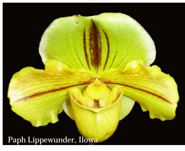
Orchid Growers' Guild, March 2013, page 9 of 10