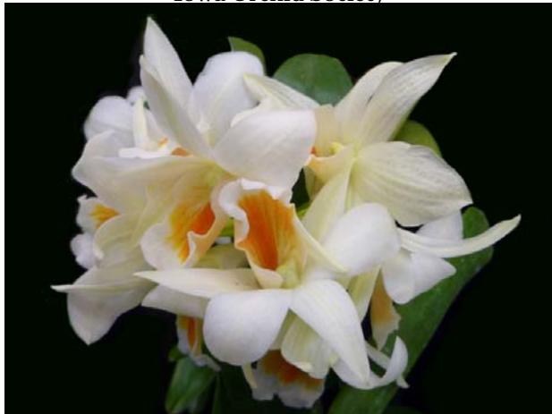
Den Frosty Dawn (Dawn Marie x Lime Frost), Batavia