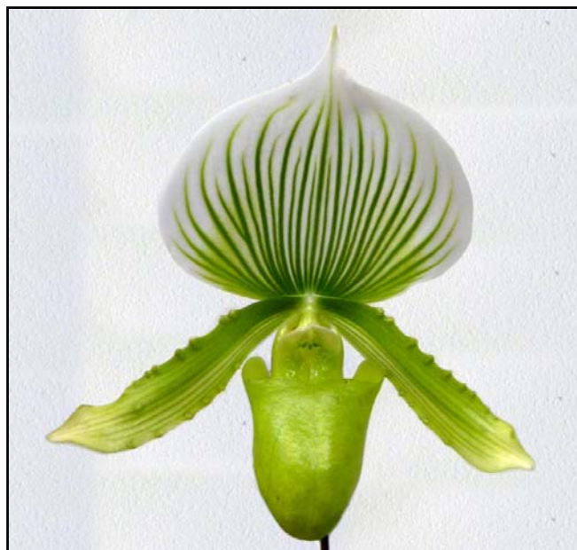
Paph. Hilo Mojito (Hilo Emerald x Hsinying Citron), First Place and BOC