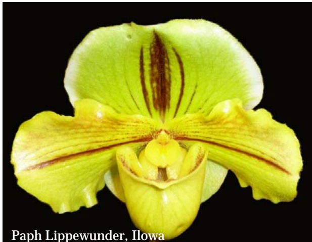
Paph Lippewunder, Iowa