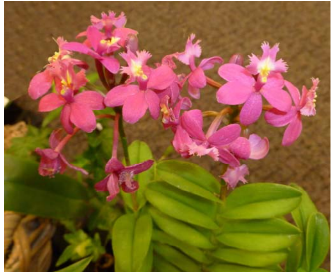
Epi Lovely Valley (Holy Valley x Miracle Valley 'Usuberii'), Eastern Iowa Orchid Society