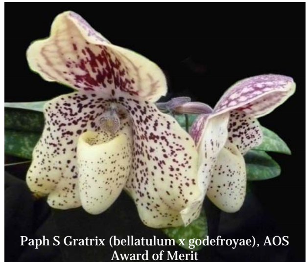
Paph S Gratrix (bellatulum x godefroyae), AOS Award of Merit

outgroups using a combination of nuclear and chloroplast DNA data. Results will be discussed, and implications for classification and understanding the evolution of Porroglossum's unique floral 'behavior' will be noted. If nothing else, you will want to come for the videos!