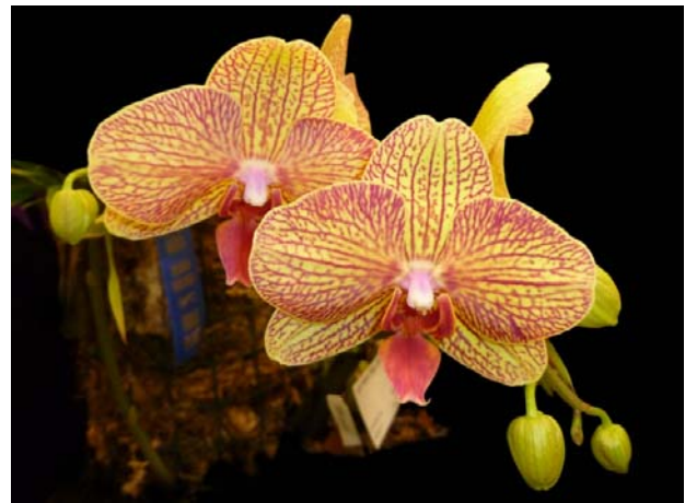
Phal KV Beauty '613' (Salu Poeker x Chih Shang's Stripes), Batavia

Orchid Growers' Guild, March 2013, page 5 of 10