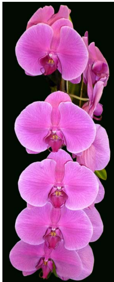
Dtps. Chian Port Sunny, First Place , Orchids Garden Center & Nursery