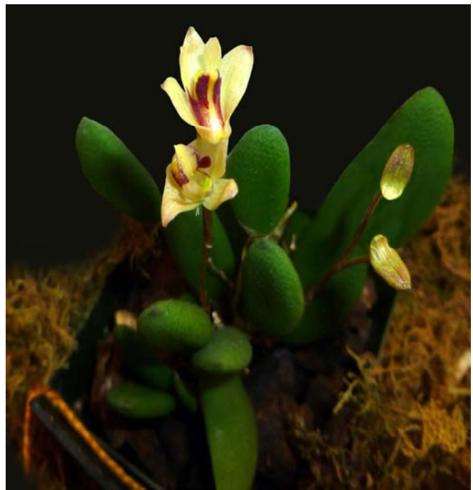
Dendrobium rigidum , Third Place , grown by Rich Narf