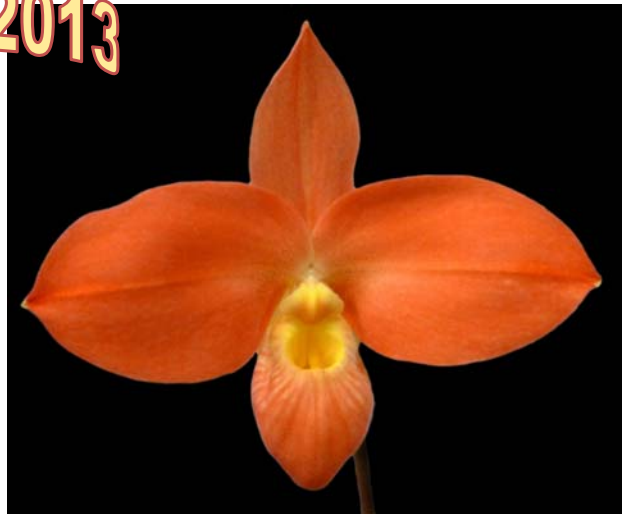
Phrag Fritz Schomburg (besseae x kovachii), Second Place , Orchid Inn