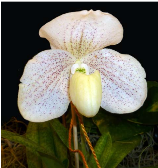
Paphiopedilum niveum 'alba' x In Charm White 'Chao Chao' BM/TPS, Second Place , Marcia Whitmore