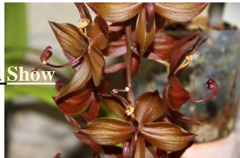
Exhibit Second Place