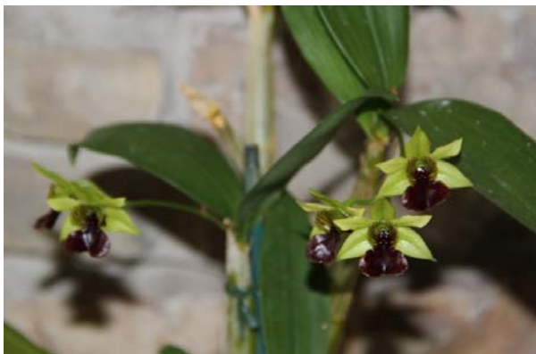
Den Green Mist (convolutum x johnsoniae)