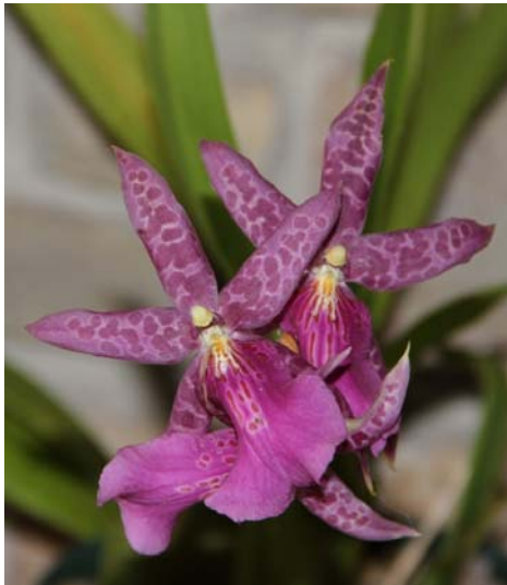
Colmanara Wildcat 'Rainbow' ( Oncostele Rustic Bridge x Oncidium Crowborough )