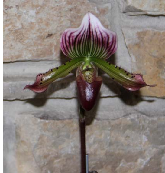
Paph. Supersuk 'Eureka' AM/AOS x Paph. Raisin Pie 'Hsinying' x Sib