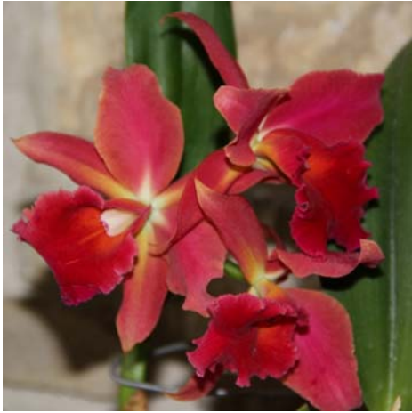
Slc. Circle of Life 'Trailblazer' AM/AOS x Lc. Magic Melody 'SVO' AM/AOS