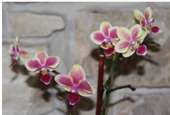
Unidentified Mini Phalaenopsis