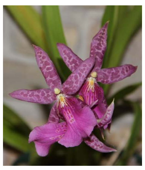
Colmanara Wildcat 'Rainbow' ( Oncostele Rustic Bridge x Oncidium Crowborough)