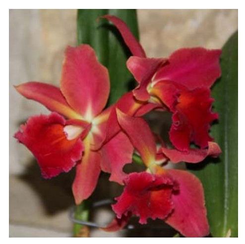
Slc. Circle of Life 'Trailblazer' AM/AOS x Lc. Magic Melody 'SVO' AM/AOS