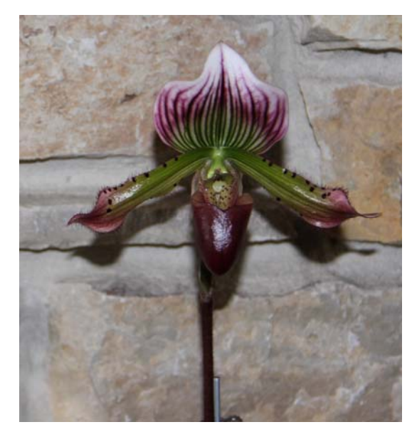
Paph. Supersuk 'Eureka' AM/AOS x Paph. Raisin Pie 'Hsinying' x Sib