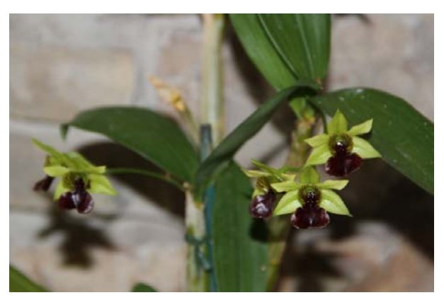
Den Green Mist (convolutum x johnsoniae)