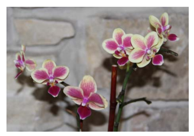
Unidentified Mini Phalaenopsis

Orchid Growers' Guild, November 2013 page 7 of 8