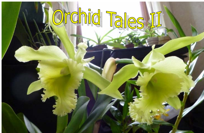
Ports of Paradise [ Rhyncholaeliocattleya Fortune x Rhyncholaelia digbyana ] above; on the right is a Dendrobium brymerianum