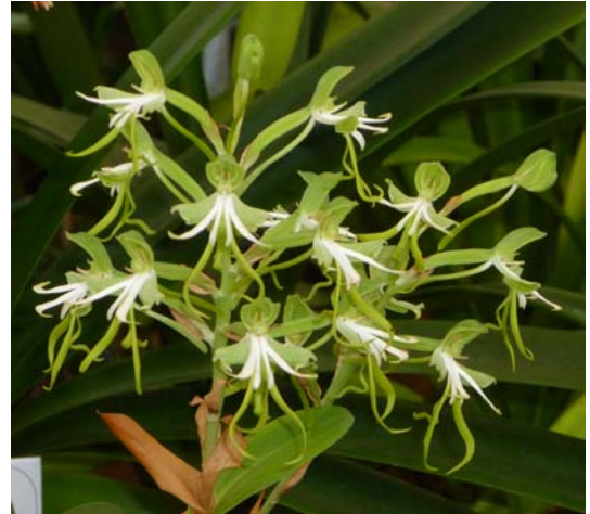
Green Wood Orchid ( Bonatea speciosa )