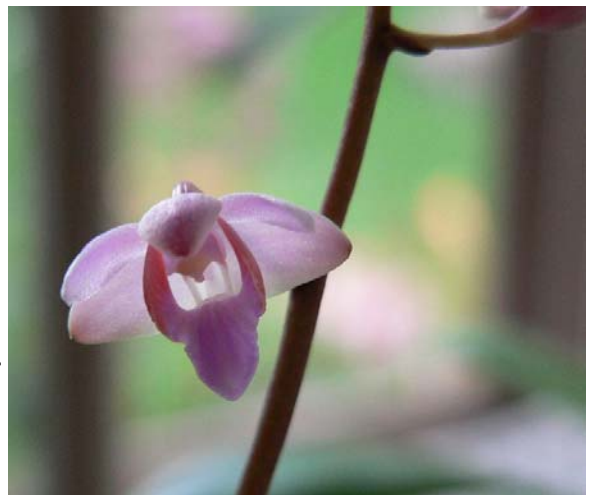
Doritis pulcherrima

Keep in mind, the second part of the challenge will be awarded at the November 2013 meeting for the plant that ends up producing the highest number of flowers during its long blooming period. So please keep a record of the total number of flowers your plant produces, right up till the end! This species is known for its extended flowering period by producing more buds out the tip of the stem.